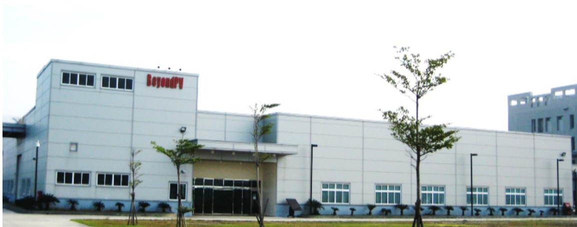
BeyondPV factory in Tainan, Taiwan (R.O.C.)

Under the terms of the MOU and proposed formal OEM Supply Agreement BeyondPV will design, manufacture and supply to ClearVue and to ClearVue's licensed manufacturers solar PV strip modules for use in ClearVue's solar PV IGU's, windows and smart façades.