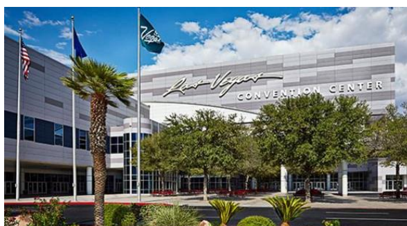
Image – Las Vegas Convention Centre

The A'19 Conference and Expo attracted one of the largest annual gatherings of architects and design professionals in the United States of America. The Expo component was focused on introducing US and international architects and designers to the latest products and technologies in construction.