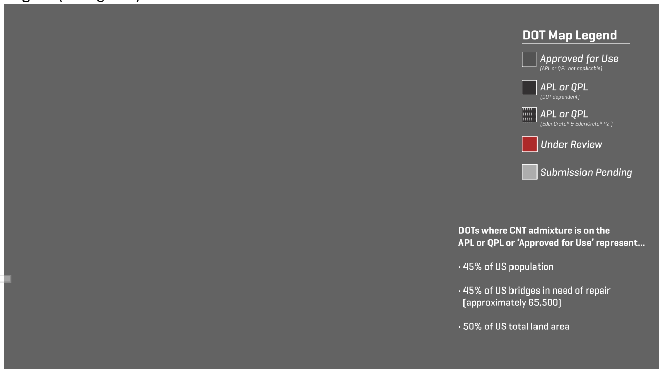
Figure 1. Current Status of US DOT Approvals of EdenCrete® Products

Alabama, Alaska, Arkansas, California, Colorado, Georgia, Kentucky, Louisiana, Mississippi, North Carolina, Oklahoma, Oregon, South Carolina, Tennessee, Texas, Vermont, Virginia and West Virginia (see Figure 1).