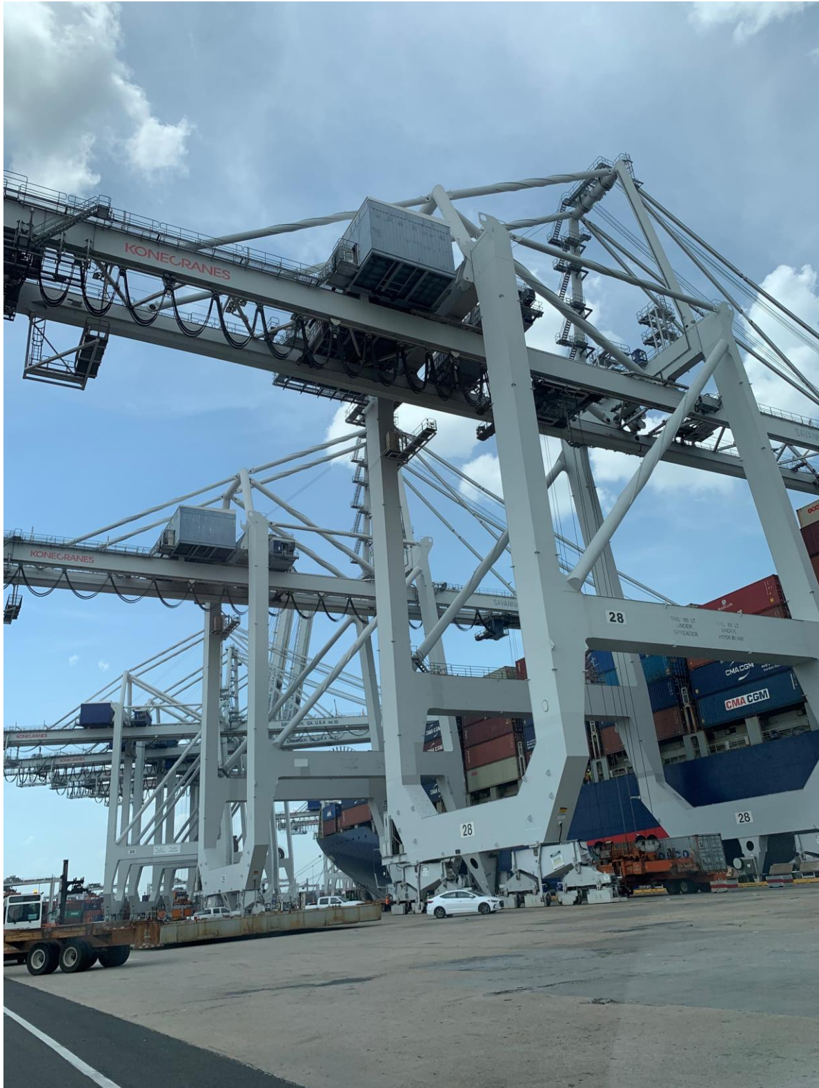
Figure 3. Some of approximately 30 ship-to-shore cranes currently operating at Port of Savannah