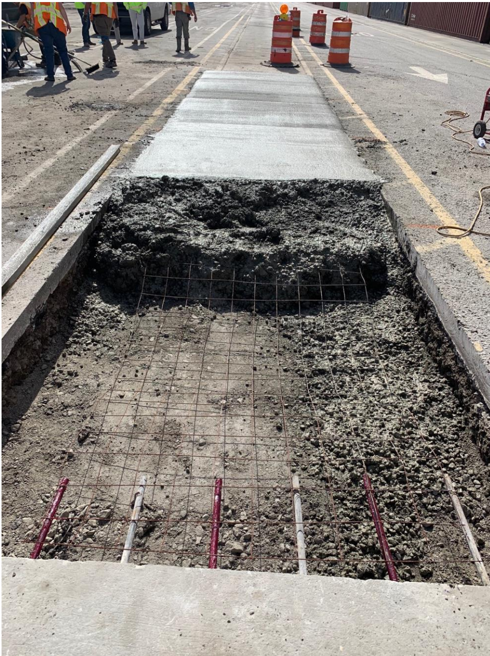
Figure 1. EdenCrete® - enriched concrete being poured at Garden City Terminal, Port of Savannah

The trial involves monitoring the on-going performance of the EdenCrete® concrete over the coming months. There is no set period for the trial, although Eden understands that the review of the performance is likely to undertaken over approximately three months.