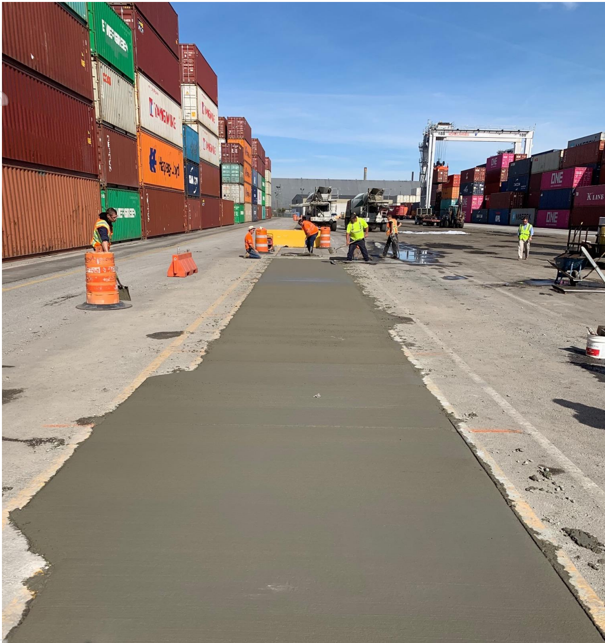
Figure 2. EdenCrete®- enriched concrete being poured at Garden City Terminal, Port of Savannah