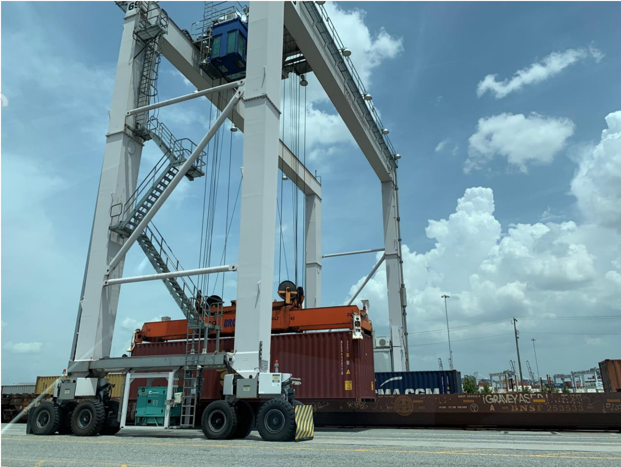
Figure 4. One of approximately 150 rubber tyred gantry cranes currently operating at Port of Savannah