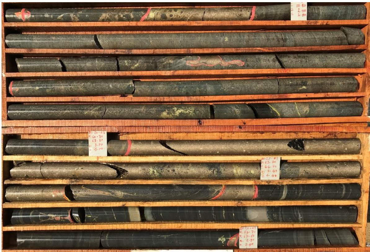
Figure 1: Blackstone's maiden Ban Chang drillhole BC20-03 intersects a 9.15m wide zone of sulfide vein mineralisation.