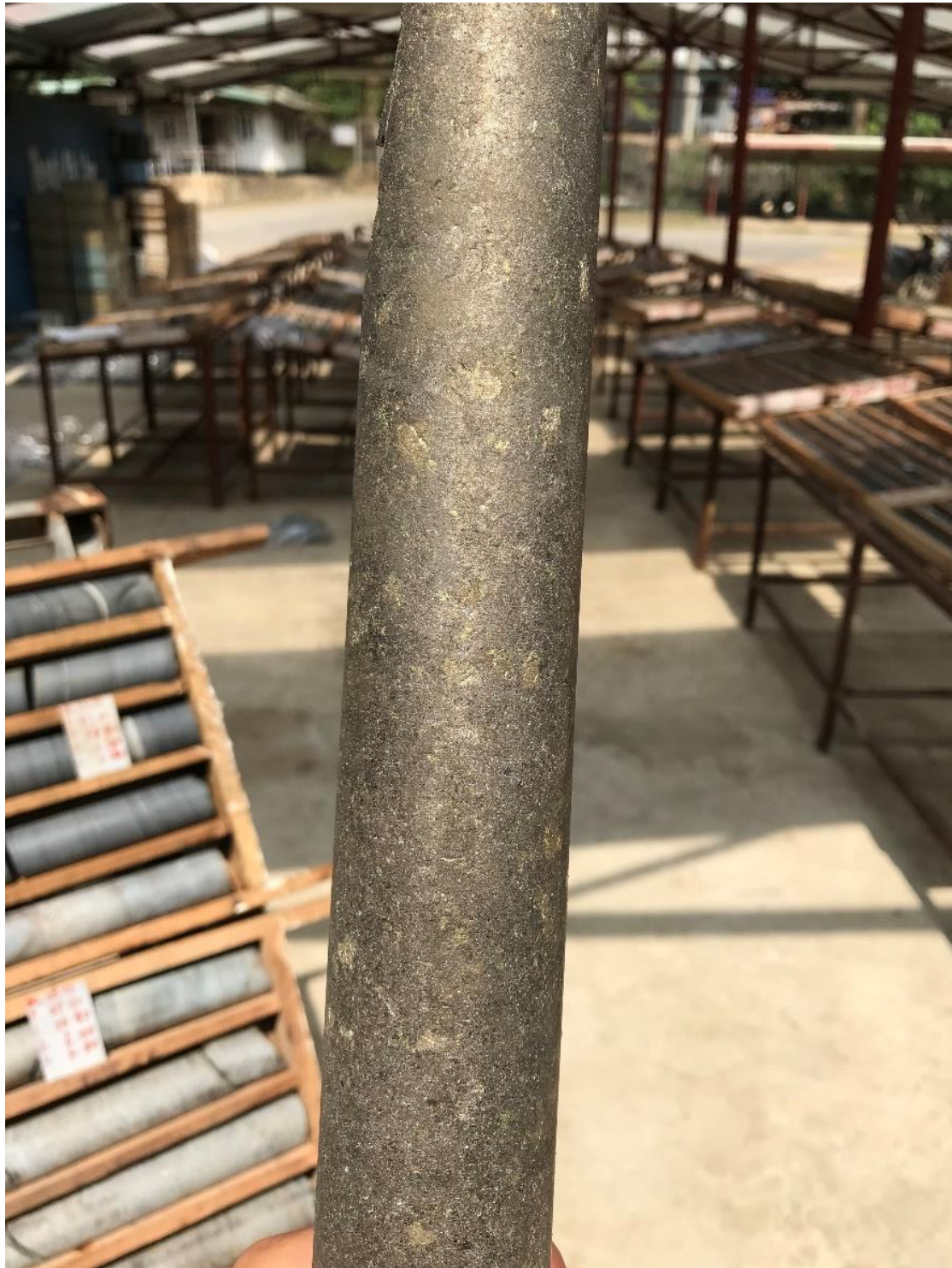
Figure 2: Blackstone's maiden Ban Chang drillhole BC20-03 intersects massive sulfide.

The drilling is part of an ongoing campaign to target regional MSV as Blackstone aims to build its resource inventory at Ta Khoa. Blackstone's second drill rig will continue to follow the in-house geophysics team throughout the Ta Khoa nickel sulfide district, testing high priority EM targets generated from 25 MSV prospects including King Snake, Ban Khoa, Ban Chang, and Ban Khang.