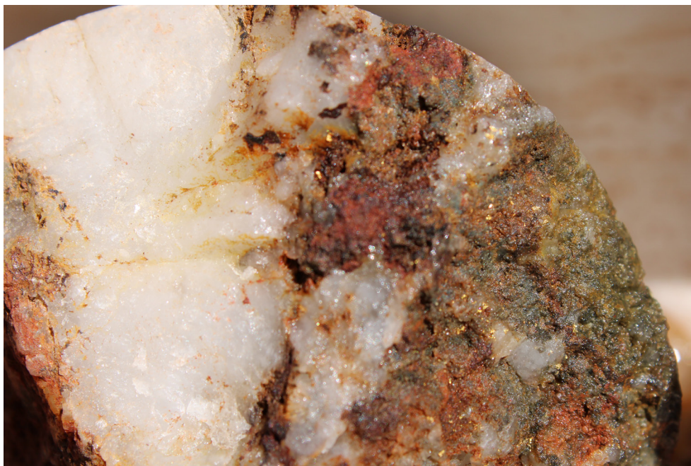
HQ drill core from SFDD20_005 at Sailfish showing abundant visible gold.