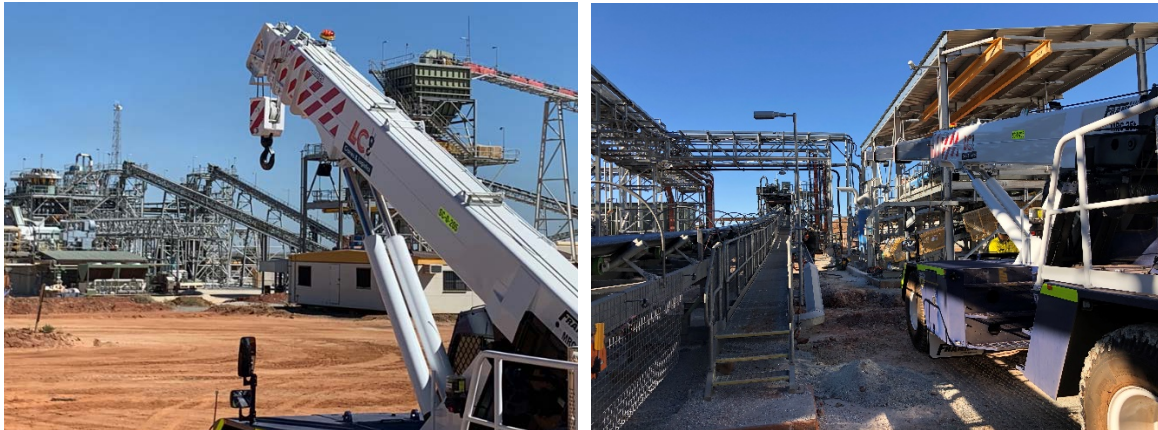
Figure 4 – LC Cranes MRC 25T Franna on Altura's Pilgangoora Site