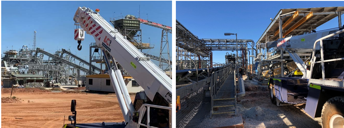
Figure 4 – LC Cranes MRC 25T Franna on Altura’s Pilgangoora Site