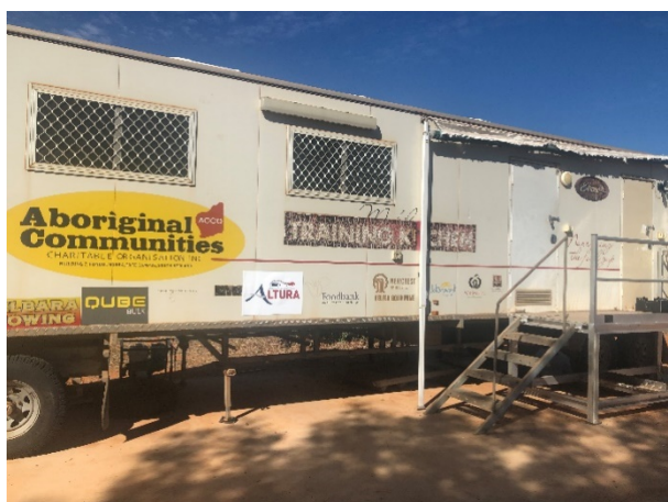
Figure 3 – Warralong and Strelley cold food storage unit and kitchen facilities

Altura also donated sporting equipment to the Strelley Community School, which with the cold food storage unit will assist with the school's existing healthy living program.