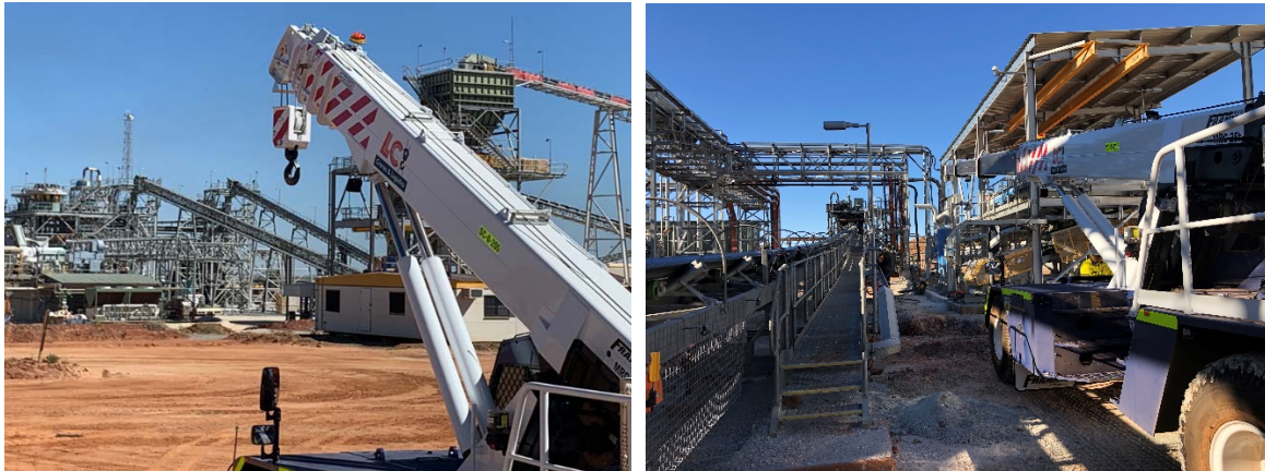
Figure 4 – LC Cranes MRC 25T Franna on Altura's Pilgangoora Site