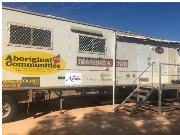
Figure 3 – Warralong and Strelley cold food storage unit and kitchen facilities

Altura also donated sporting equipment to the Strelley Community School, which with the cold food storage unit will assist with the school's existing healthy living program.