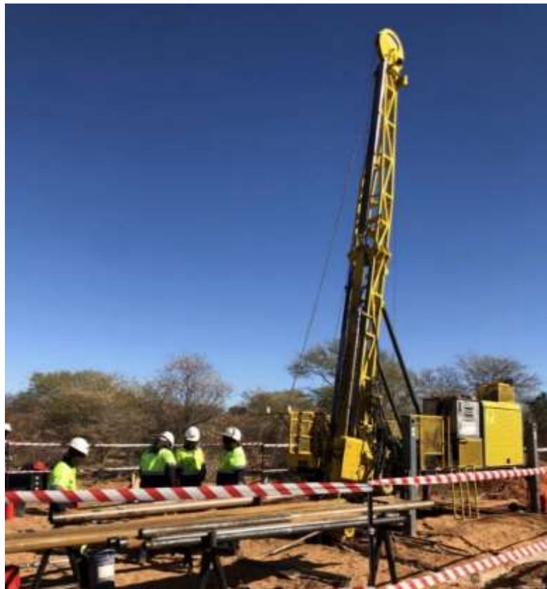
Figure 1: Recent KML drilling operations

Botswana’s recent COVID-19 lockdown has now eased allowing KML to restart their 2020 exploration program, which is scheduled to include drilling of the Kitlanya East and Kitlanya West prospects. Drilling has already commenced at Kitlanya East.