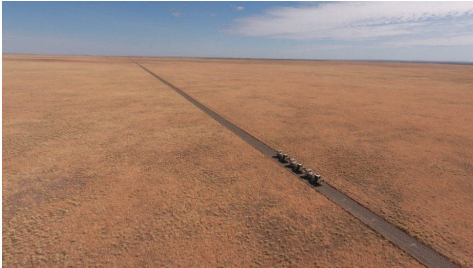
Photo 1 – Barkly Tablelands – Northern Territory

New datasets provided by Geoscience Australia (“GA”) as part of the Exploring for the Future Program provide crucial new data to open up and facilitate exploration in this covered, highly prospective and underexplored region of Australia (Photo 1).