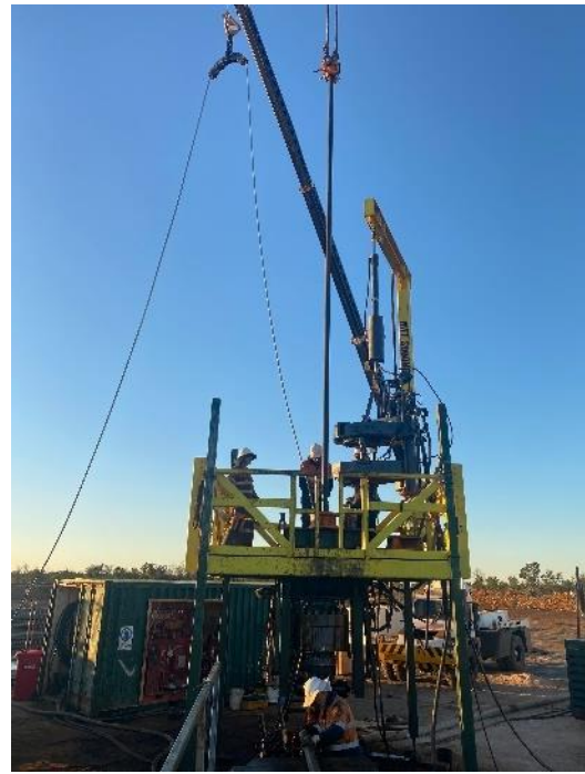
Buru Jacking Platform at Ungani 7

Ungani crude oil continues to be trucked to CGL storage Tank 10 at Wyndham Port prior to its FOB sale. With all currently configured wells online, excluding Ungani Far West 1, field production capacity is ~1,100 bopd.