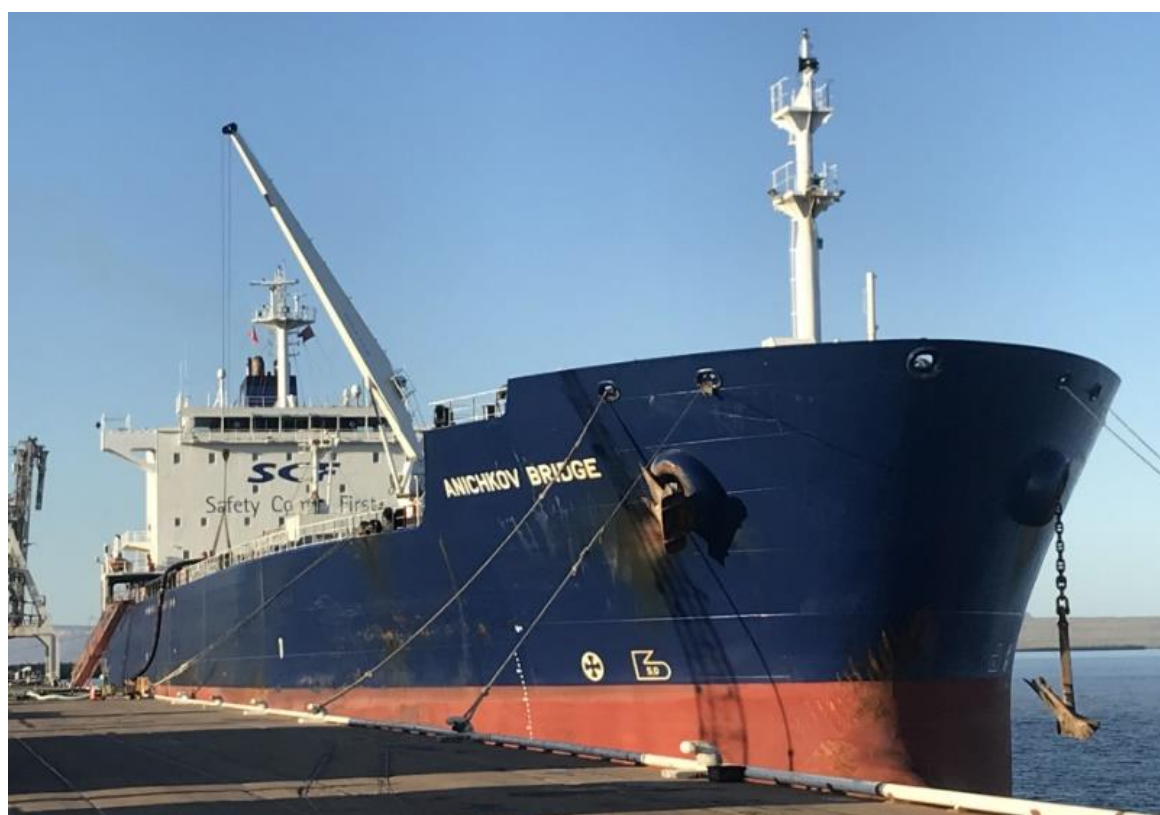
Ungani crude lifting at Wyndham in September by the Anichkov Bridge

During the quarter, the Buru-ROC Joint Venture entered into a longer term marketing agreement with BP Singapore Pte Limited (BP) through to 30 June 2021 whereby BP market the Ungani crude by offtaking the crude from Wyndham Port on an FOB basis and on-selling the oil into market. The September lifting was the first lifting under this new marketing agreement and was completed on 26 September 2020 for a total of 71,038 bbls (gross - Buru's share 50%). Under the marketing contract, the price received will be the actual price BP sold the crude to the refinery (a fixed differential to the average dated Brent price for the month of October), less shipping and associated costs. Under these terms Buru's 50% revenue share from the lifting is currently estimated at ~A$1.6 million, with the price to be finalised at the end of October.