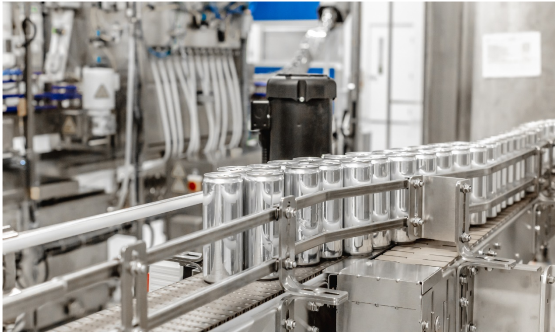
Image 1 – Cannabis beverage manufacturing at the Peak Processing Solutions facility

On 22 June, the Company announced that Peak had signed a binding cannabis beverage production agreement with Collective Project Limited, the cannabis-focused sister company of Collective Arts Brewing Limited, with manufacturing expected to commence during the December 2020 quarter.