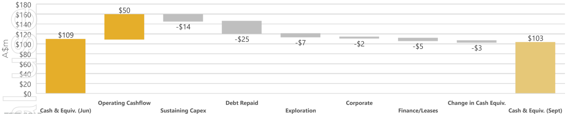
MOVEMENT IN CASH & EQUIVALENTS SEPTEMBER 2020