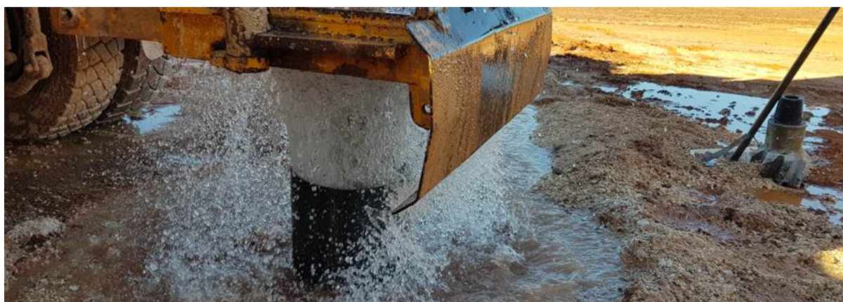
Figure 1: Water test bore drilling programme.

A number of standard pump tests were conducted to test the aquifer potential and groundwater flow modelling has been completed to analyse a number of potential borefield designs.