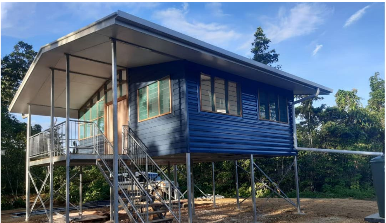
Figure 3: Three room deluxe house

A Community Relocation Amendment Agreement was drafted to include the new house designs and submitted to the Papua New Guinea Mineral Resources Authority (MRA) for their consideration. Approval has been granted to proceed with the construction and the signing of the agreement has now commenced.