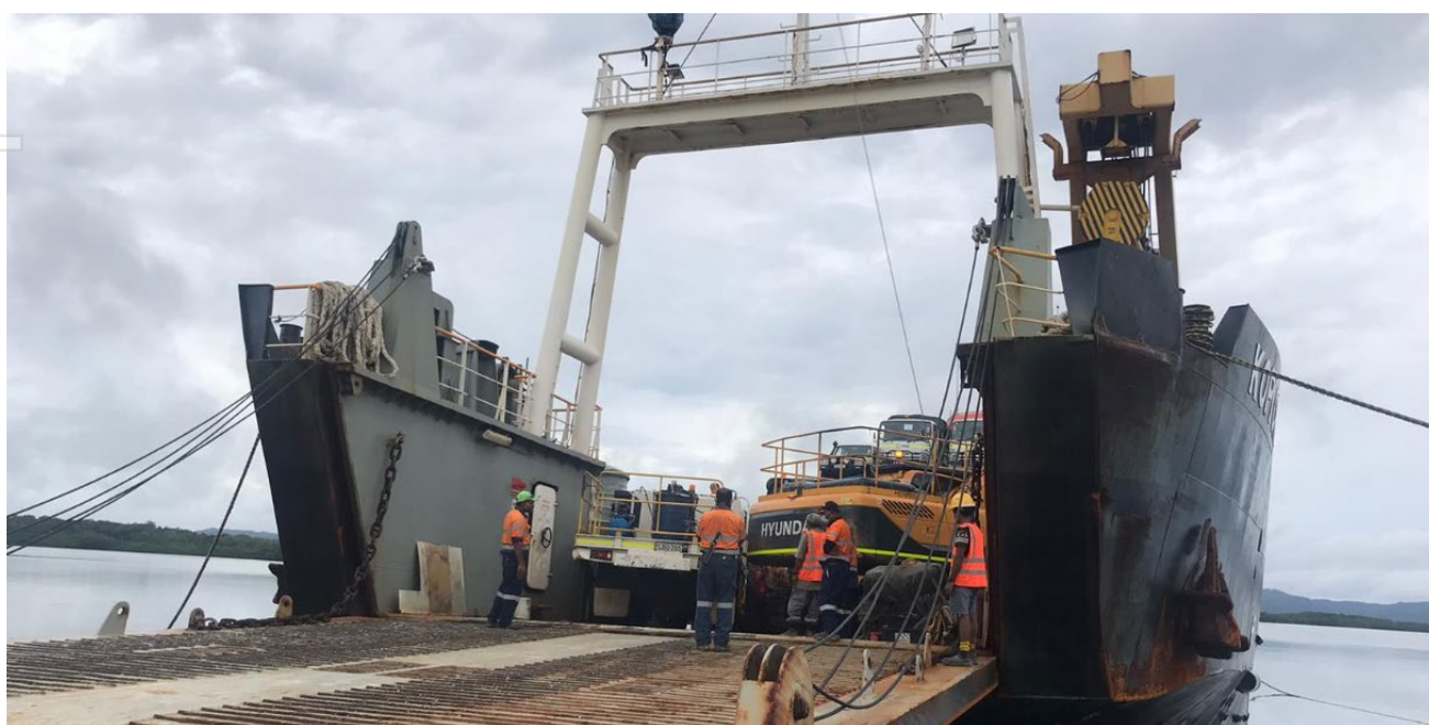
Figure 1: Equipment mobilised to site to continue the Civil Works Program

While COVID-19 has impacted site operations over recent quarters, the amount of work that has been completed by the project team in the interim to revalidate the capital and operating cost models has been substantial. The level of detail associated with the schedule execution, capital and operating cost inputs far exceeds industry norms for a project at a comparable stage in the development cycle. It is also pleasing to see contractors remobilising to site to continue early construction activities with road works and housing construction a focus over the coming quarters, while planning continues for a targeted exploration program to be undertaken in parallel with construction. With the confirmation of Sprott Private Resource Lending II L.P. as the preferred debt provider, Geopacific is well placed to commence formal construction of the Woodlark project in 2021 with first gold targeted in late 2022."