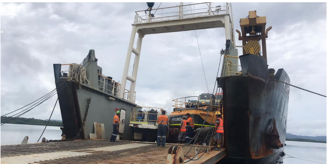
Figure 1: Equipment mobilised to site to continue the Civil Works Program

While COVID-19 has impacted site operations over recent quarters, the amount of work that has been completed by the project team in the interim to revalidate the capital and operating cost models has been substantial. The level of detail associated with the schedule execution, capital and operating cost inputs far exceeds industry norms for a project at a comparable stage in the development cycle. It is also pleasing to see contractors remobilising to site to continue early construction activities with road works and housing construction a focus over the coming quarters, while planning continues for a targeted exploration program to be undertaken in parallel with construction. With the confirmation of Sprott Private Resource Lending II L.P. as the preferred debt provider, Geopacific is well placed to commence formal construction of the Woodlark project in 2021 with first gold targeted in late 2022.”