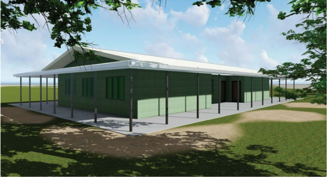
Figure 4: The new school complex will include 5 double classroom buildings (10 classrooms in total), separate male and female dormitories, ablutions facilities and a sports field.