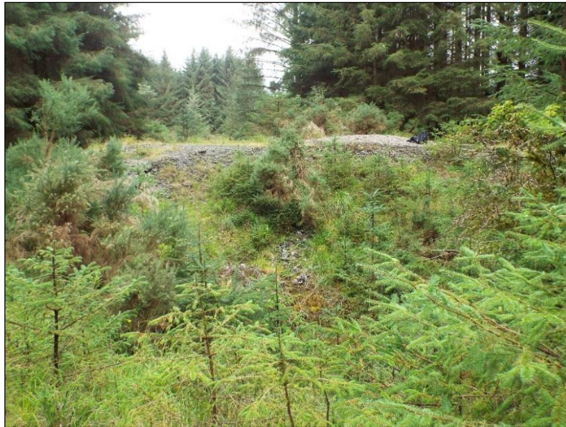
Figure 1: Historical spoil heaps of the Silver Rig mine within the licence area.

Covid-19 restrictions have somewhat delayed the permitting applications for the planned low-cost tenement scale airborne-drone geophysical program as previously reported, with final approvals expected to be granted within the fourth quarter. This will now proceed upon election once approvals are received.