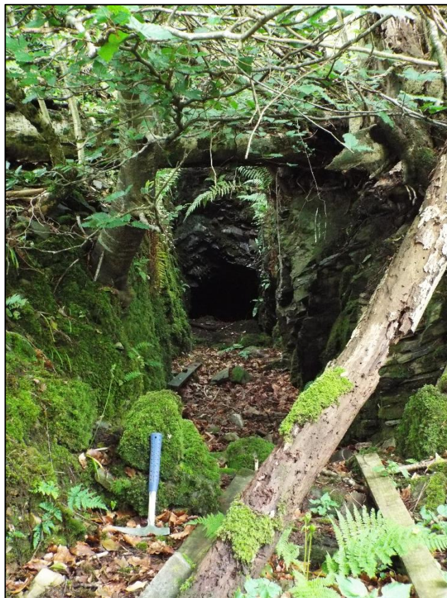
Figure 2: Mining remnants from the Blackcraig mine within the licence area.

Important stakeholder engagement through the Scotland-based social and community risk specialist consultancy is ongoing with all parties regularly being updated on the Company's activities, progress and plans within the area and any comments and suggestions well received and incorporated into these plans.