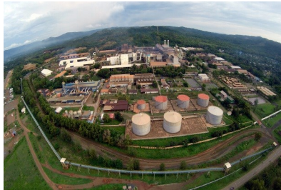
Pomalaa Ferronickel Plant

For the First Nine Month Ended September 30,2020 ARBN - 087 423 998 Securities Ticker: ASX: ATM, IDX: ANTM