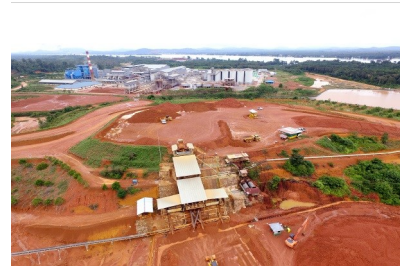
Tayan Bauxite Mine