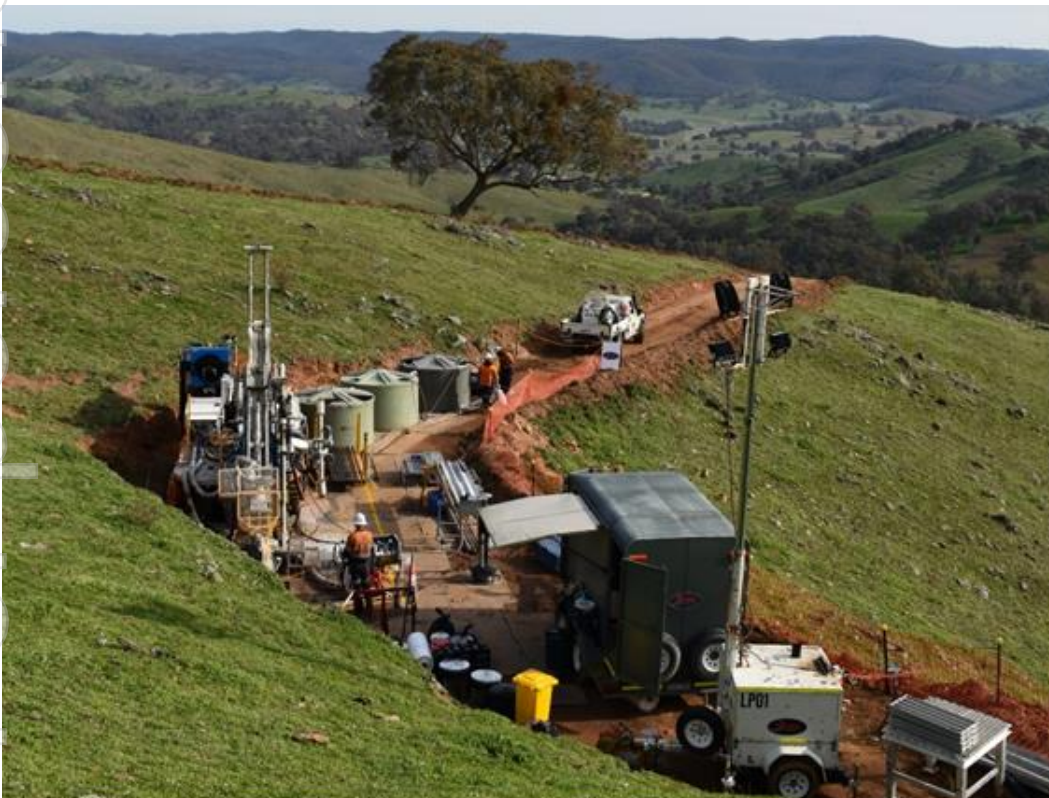
Figure 1. Drill rig turning at high grade gold quartz reef Castor Reef

During the period, the Company commenced its maiden drill programme at the 100% owned Mt Adrah Gold Project in the Lachlan Fold Belt of New South Wales ("NSW"). This programme was completed subsequent to the end of the quarter with core samples having been prepared and sent for assay in NSW with final results expected shortly.