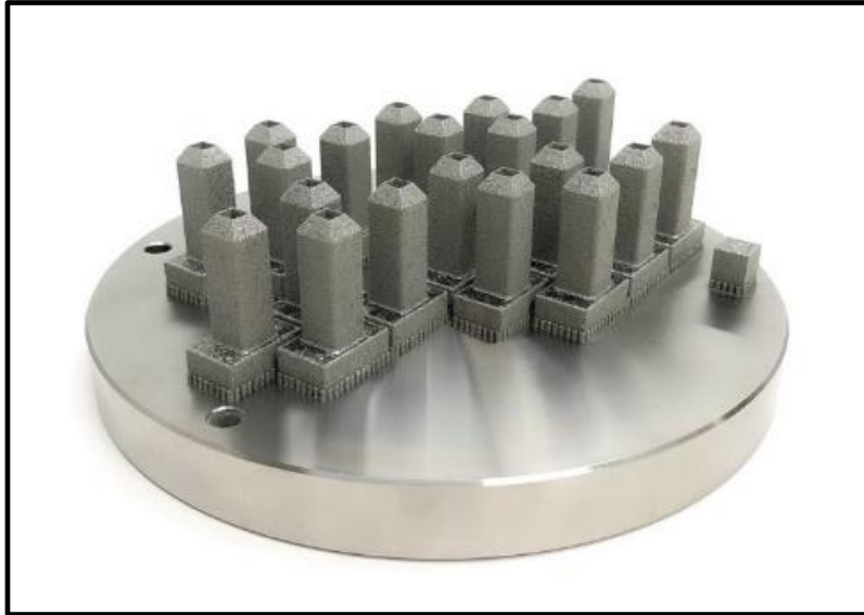
Industrial manufacturing 5mm hole punches printed in 17-4PH to be used in the manufacture of rubber screen mats in the mining industry (Printed on A3D's Alpha2 machine)