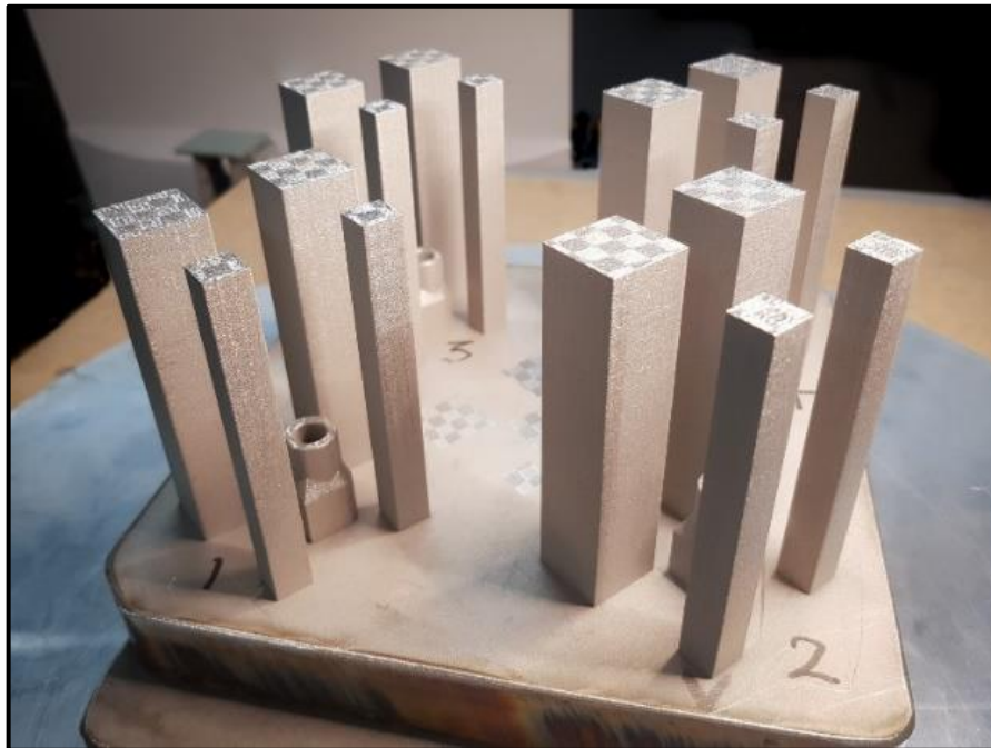
Fig 1: Tensile Bars printed at high laser power

Testing undertaken by a 3 rd party NATA certified laboratory in accordance with appropriate powder bed fusion printing standards demonstrate compliance with the standards though achievement of as printed density greater than 99% and tensile properties in line with other commercially available powder bed fusion printers; the key difference is that this has been achieved at considerably higher laser power.