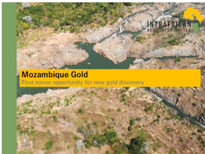
Photo of the potential 'Muteger' gold trap in the Lurio River subject to exploration and dredging development

IEC has entered into an Investment Agreement with Intra Minerals Ltd (IML) to buy an additional 30% of shares in the company for the investment of US$1.3m with the option to purchase up to 15% additional shares. IML has also engaged an operations consultant with "hands-on" experience in establishing gold mining operations in Southern Africa in conditions similar to the Minas Do Lurio project. IEC has mandated Bellhouse Capital PLC, an UK-based Financial Advisor to prepare a Presentation and advise on the capital raising route for IRL.