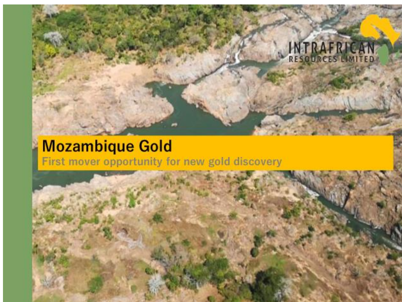
Photo of the potential 'Muteger' gold trap in the Lurio River subject to exploration and dredging development

IEC has entered into an Investment Agreement with Intra Minerals Ltd (IML) to buy an additional 30% of shares in the company for the investment of US$1.3m with the option to purchase up to 15% additional shares. IML has also engaged an operations consultant with "hands-on" experience in establishing gold mining operations in Southern Africa in conditions similar to the Minas Do Lurio project. IEC has mandated Bellhouse Capital PLC, an UK-based Financial Advisor to prepare a Presentation and advise on the capital raising route for IRL.