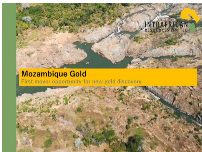
Photo of the potential 'Muteger' gold trap in the Lurio River subject to exploration and dredging development

IEC has entered into an Investment Agreement with Intra Minerals Ltd (IML) to buy an additional 30% of shares in the company for the investment of US$1.3m with the option to purchase up to 15% additional shares. IML has also engaged an operations consultant with "hands-on" experience in establishing gold mining operations in Southern Africa in conditions similar to the Minas Do Lurio project. IEC has mandated Bellhouse Capital PLC, an UK-based Financial Advisor to prepare a Presentation and advise on the capital raising route for IRL.