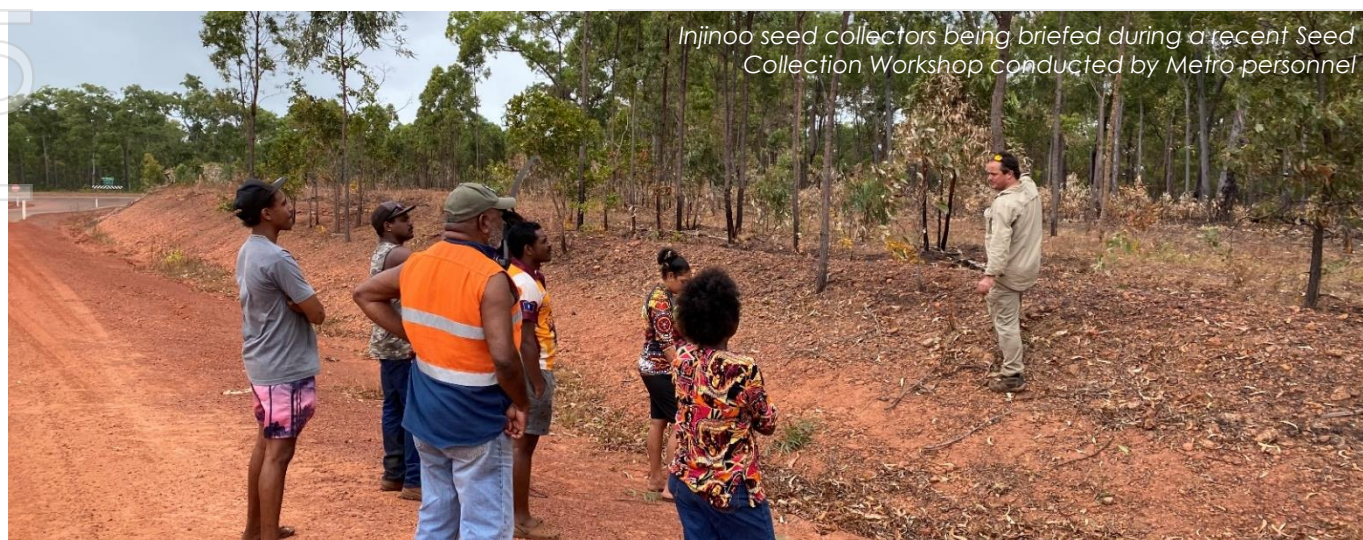
Injinoo seed collectors being briefed during a recent Seed Collection Workshop conducted by Metro personnel

Monthly community seed collection programs continued in Mapoon, and recommenced in Injinoo, over the quarter. It was noted that an increase in the amount of seed volumes collected are required to meet the rehabilitation plan and community focus will be lifted to meet the required targets.