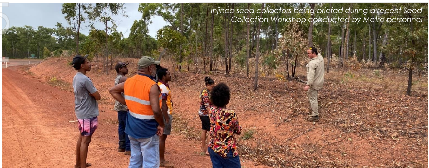
Injinoo seed collectors being briefed during a recent Seed Collection Workshop conducted by Metro personnel

Monthly community seed collection programs continued in Mapoon, and recommenced in Injinoo, over the quarter. It was noted that an increase in the amount of seed volumes collected are required to meet the rehabilitation plan and community focus will be lifted to meet the required targets.