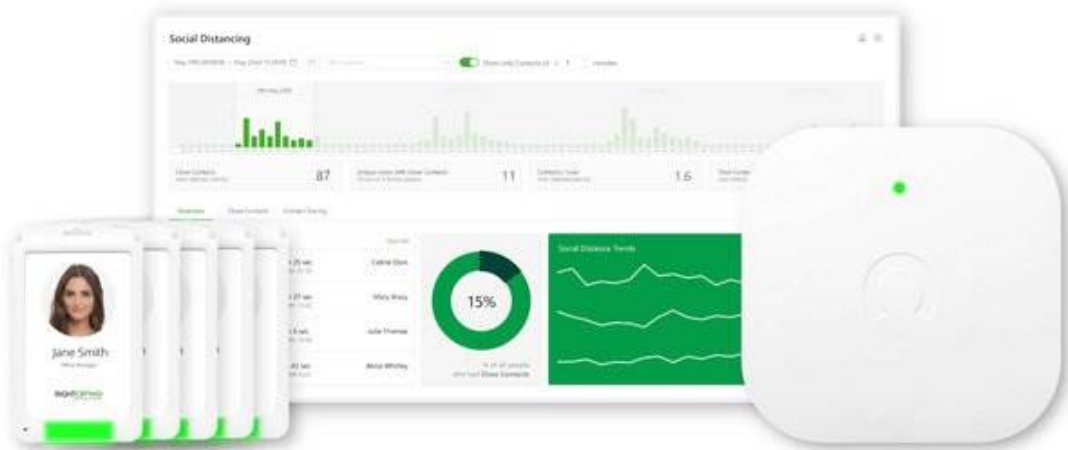
Snapshot of RightCrowd's Social Distancing Monitoring and Contact Tracing software interface and hardware