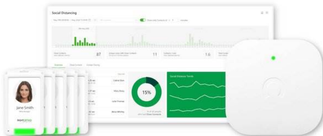
Snapshot of RightCrowd's Social Distancing Monitoring and Contact Tracing software interface and hardware