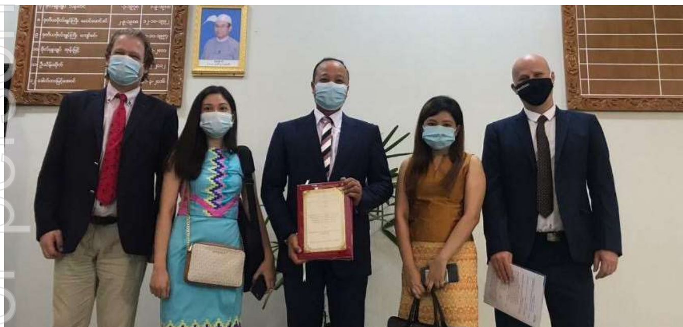
Figure 2. Representatives from Locrian and MYL with the granted permit.

In August 2020, the Company announced it had exercised the option to acquire a 51% shareholding in Locrian Precious Metals Company Limited (“Locrian”) with the right to earn up to an 85% interest. Exercise of the Locrian option followed the granting of the Tarlay Integrated Exploration License (“Tarlay”), which occurred earlier in the September Quarter. The granting of Tarlay was a very positive development for the Company as it allows for the start of exploration activities on site and importantly, it provided evidence that the permitting process in Myanmar is still very much operational, notwithstanding disruptions caused by COVID-19.