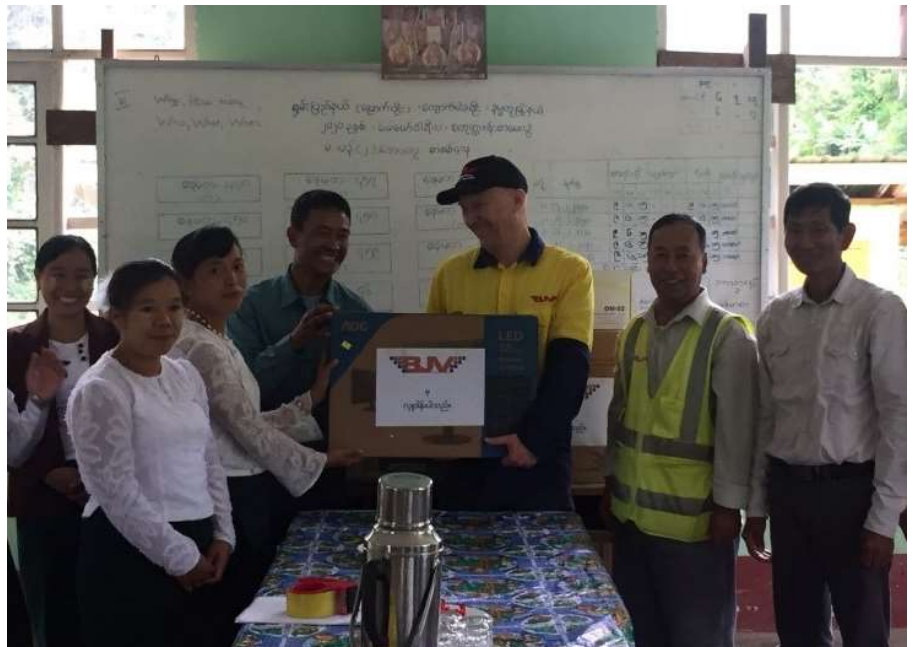
Figure 1. BJV representatives donating computing equipment to Bawdwin Upper School.