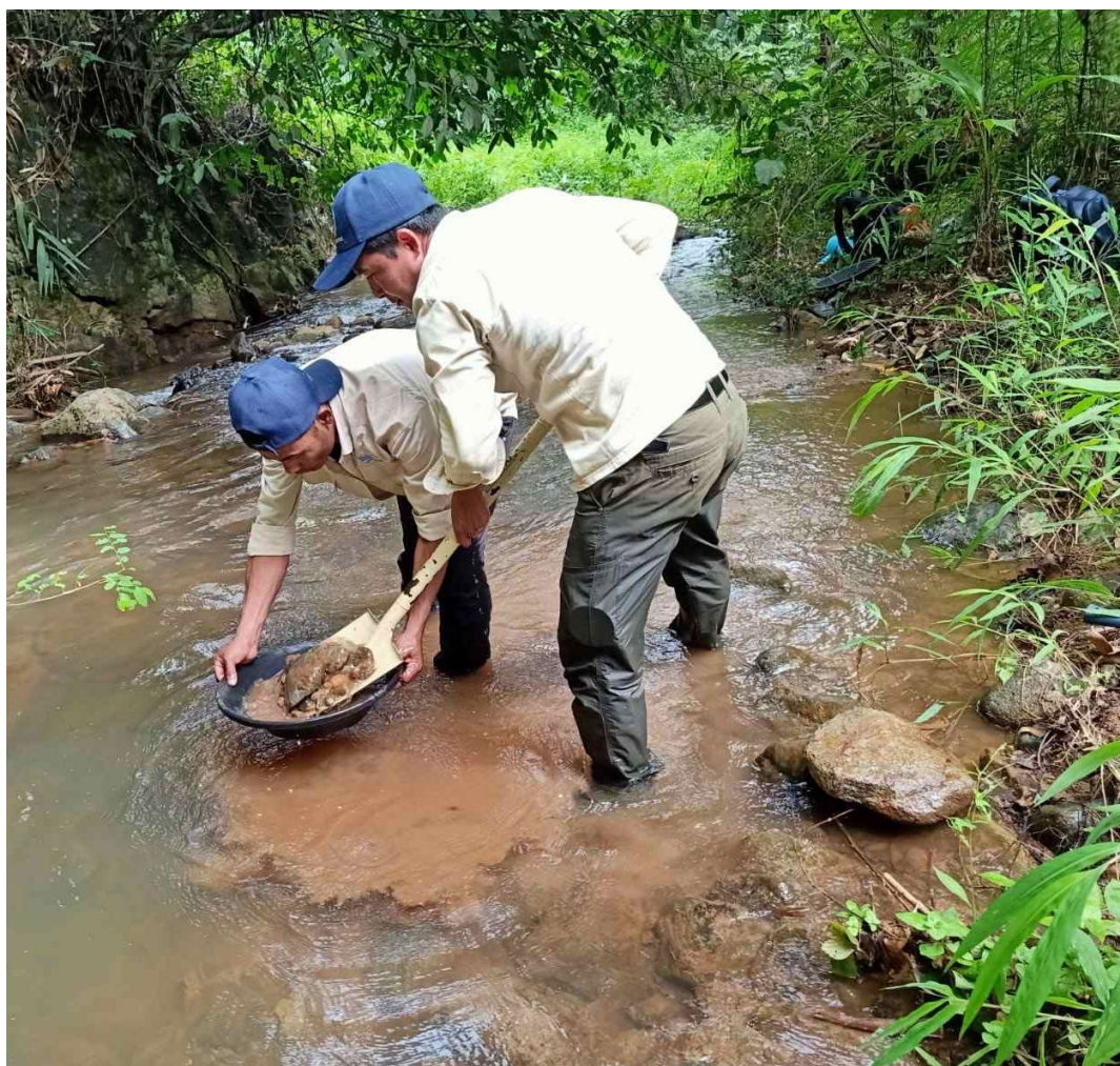
Figure 3. Sampling team at Tarlay panning concentrates from stream sediments.

During the Quarter the Company received results from a reconnaissance sampling program conducted earlier in 2020. The sampling program included 29 rock chip samples and 49 stream sediment and panned concentrate samples. The reconnaissance sampling builds on earlier work done by Locrian between 2015 and 2017, when 60 stream sediment and 59 panned concentrate samples were collected.