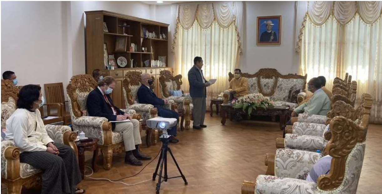
Figure 5. BJV representatives with Senior Shan State Officials.

BJV’s ESIA will follow international standards and guidelines, including the Equator Principles and IFC Performance on Environmental and Sustainability. The ESIA underpins BJV’s commitment to manage its operations responsibly with due care for sustainable environmental and community outcomes and is expected to be completed for submission to ECD in 2020.