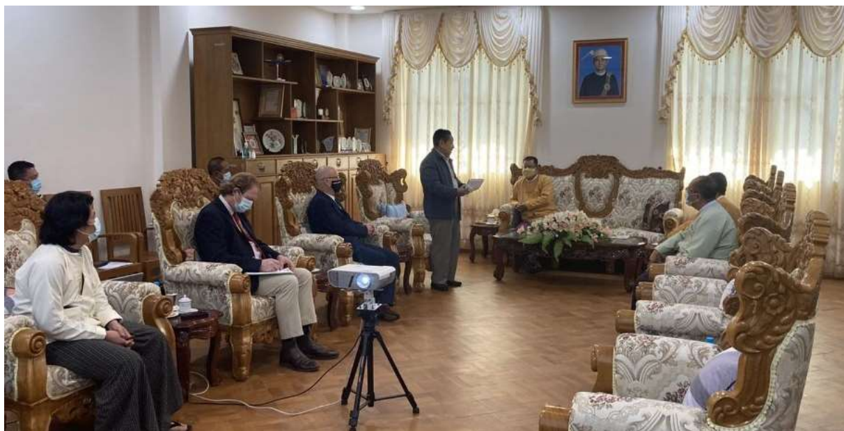
Figure 5. BJV representatives with Senior Shan State Officials.

BJV’s ESIA will follow international standards and guidelines, including the Equator Principles and IFC Performance on Environmental and Sustainability. The ESIA underpins BJV’s commitment to manage its operations responsibly with due care for sustainable environmental and community outcomes and is expected to be completed for submission to ECD in 2020.