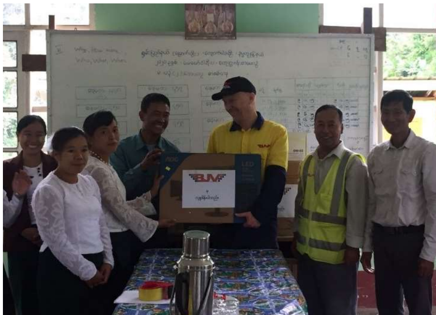
Figure 1. BJV representatives donating computing equipment to Bawdwin Upper School.