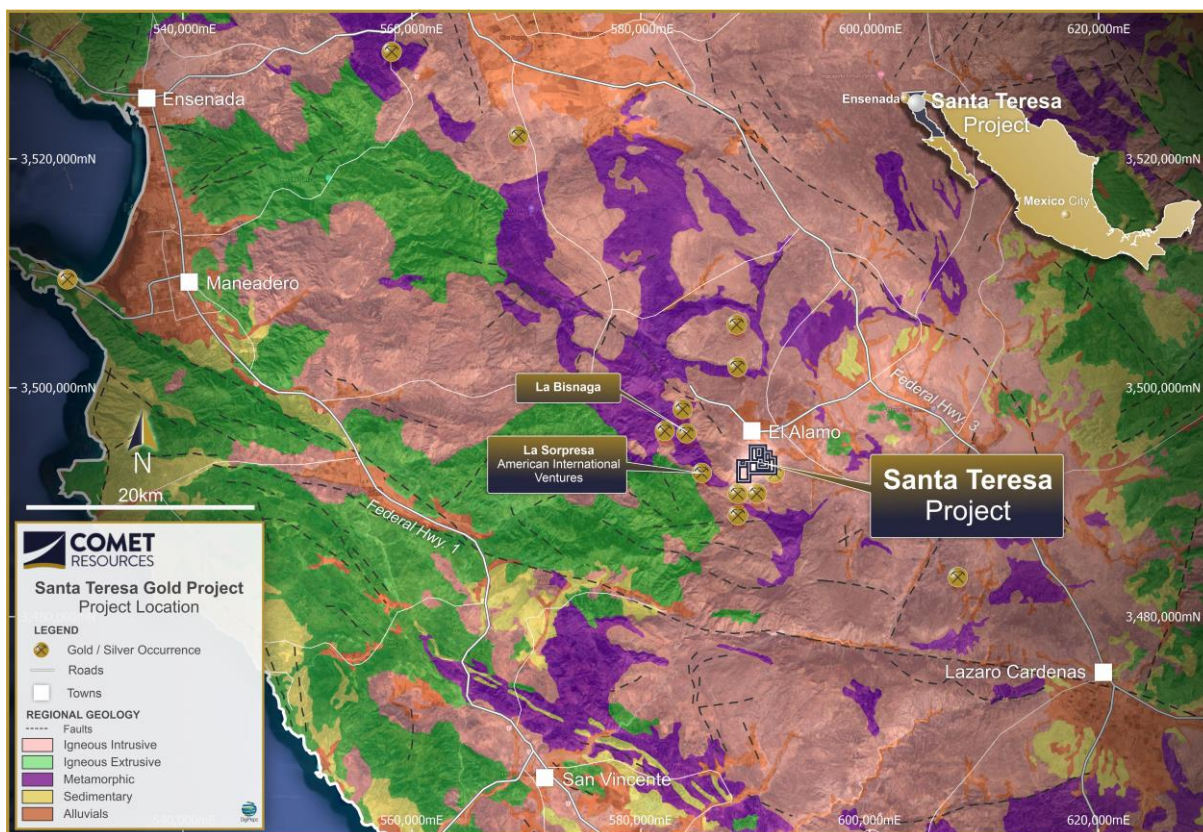
Figure 1: Regional Geology of the Santa Teresa Gold Project

The acquisition of the Santa Teresa Gold Project, completed during the quarter, is further enhanced by funding from Raptor Capital International of $US6M (up to US$20M) via a gold stream and royalty facility. The use of proceeds is to fund development activities at Santa Teresa and the facility will be secured only against the Santa Teresa Gold Project itself and any further tenements acquired in the region.