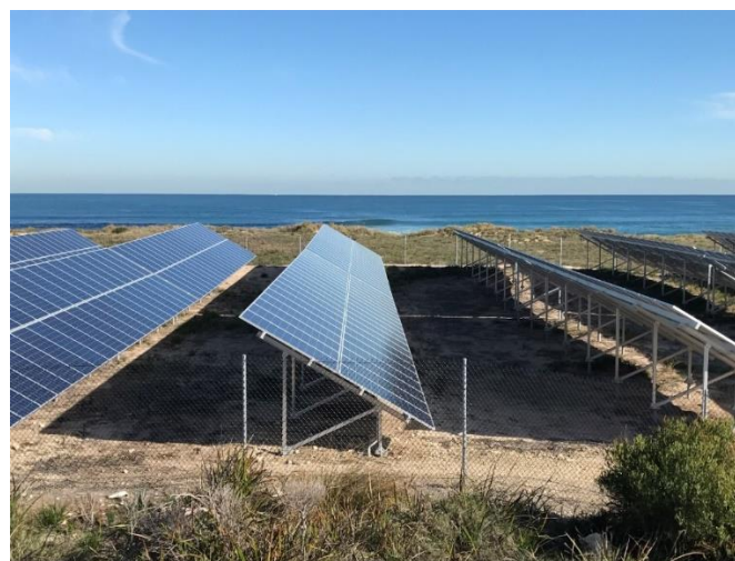
Garden Island Microgrid

Carnegie’s contractors are currently onsite finalising the reconnection works to the upgraded Defence electrical system and Carnegie is working towards securing Defence consent to recommence electricity generation from the Garden Island Microgrid in the near future.