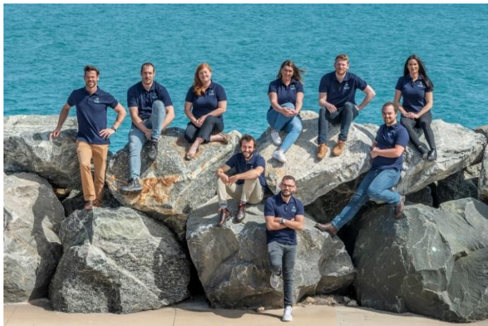
Thanks for your support from your Carnegie team

As a precaution in relation to COVID-19, each Resolution will be decided by poll, based on proxy votes and by votes from Shareholders in attendance at the Meeting. Shareholders are strongly encouraged to vote by lodging their proxy form, in accordance with the instructions set out in the proxy form, by no later than 9.00am (AWST) on 23 November 2020.