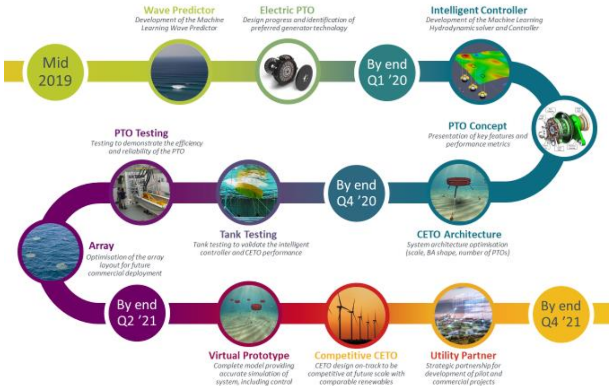
Updated Digital Development Pathway