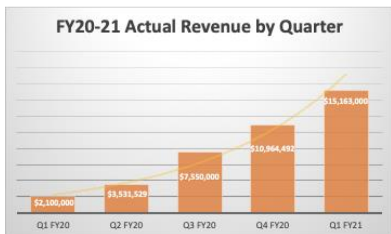
Figure 1: FY20-21 Actual Revenue by Quarter

The Company is pleased to announce that Q1 revenue of $15.1M was achieved, up 42.5% from the previous quarter. Q1 revenue included two months of revenue from Seer Security and one month's revenue from both Airloom and Ludus.