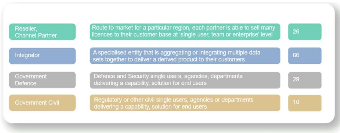
Figure 1: Pipeline summary. Note; each reseller/channel partner opportunity represents multiple potential end user licence opportunities

The Kleos business model is to create subscription-based revenues from delivery of essential data to government and commercial entities around the globe. Kleos will be the first company to fly clusters of four satellites to accurately detect and locate the usage of the RF spectrum by legitimate and illegitimate actors. The data is collected and downlinked from the satellites then processed through the Company's proprietary algorithms. Once 'packaged' into data products and transferred to our licenced subscribers 'as-a-service', the same data can be sold unlimited times creating annuity type revenues. Kleos data product pricing scales with the launch of additional clusters collecting more data. The 2 nd Cluster is targeted for mid-2021 and the 3 rd cluster in late 2021. Each additional cluster generates further data sets increasing revenues correspondingly.