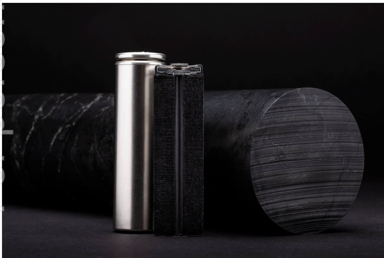
Figure 6. Vittangi graphite drillcore with size 2170 (L) and 18650 (R) Li-ion batteries (cut to expose the anode).

This continued growth in graphite resources positions Talga for an increasingly significant role in battery anode production for the booming electric vehicle markets. As an approximate guide there is ~1 million tonnes of graphite anode per 20 million electric vehicles, and the European Commission has classified graphite a Critical Raw Material necessary for the transition to a more sustainable society.