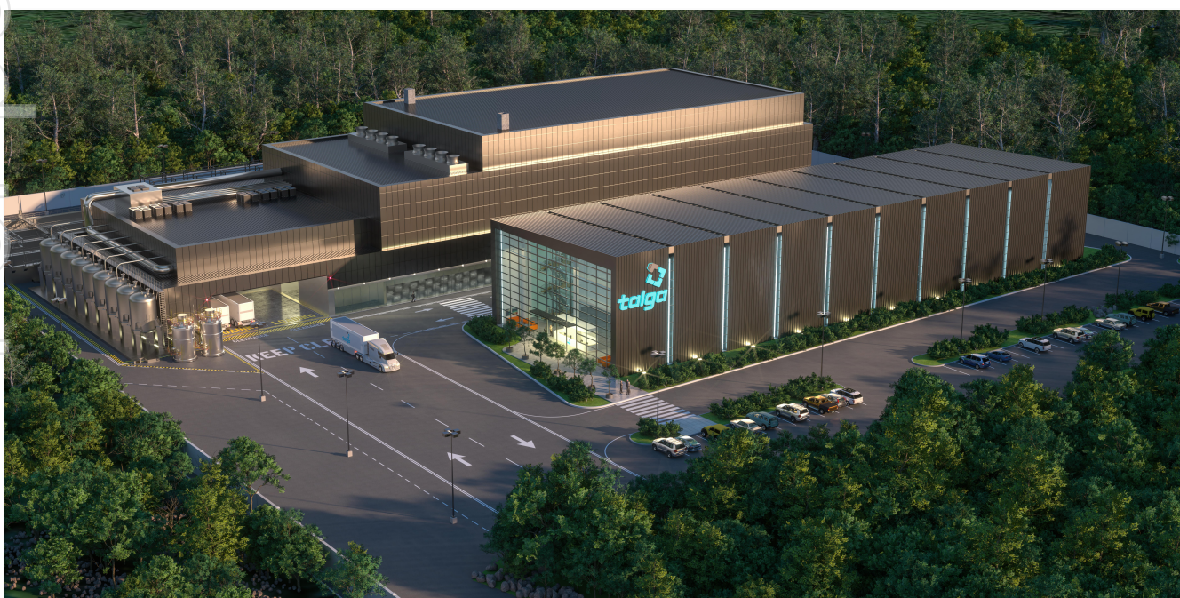
Figure 1. Visualisation of Talga's planned 19,000 tonnes per annum battery anode refinery.

Talga will look to further refine these outcomes in the upcoming commercial Detailed Feasibility Study ("DFS") planned for completion in Q1 2021.