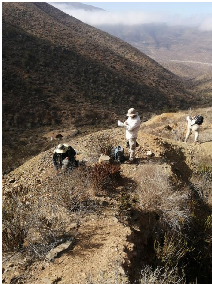
Figure 2 – Exploration team sampling at El Dorado with PanAmerican highway in background