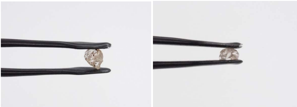
The 1.08 carat diamond and 0.25 carat Type IIa diamond recovered from L071

As part of the continuing Cacuilu tributary sampling program, gravel identified in the Xangando drainage will be drilled and pitted in preparation for sample excavation. An additional location has been identified for gravel sampling in the Zavige drainage.