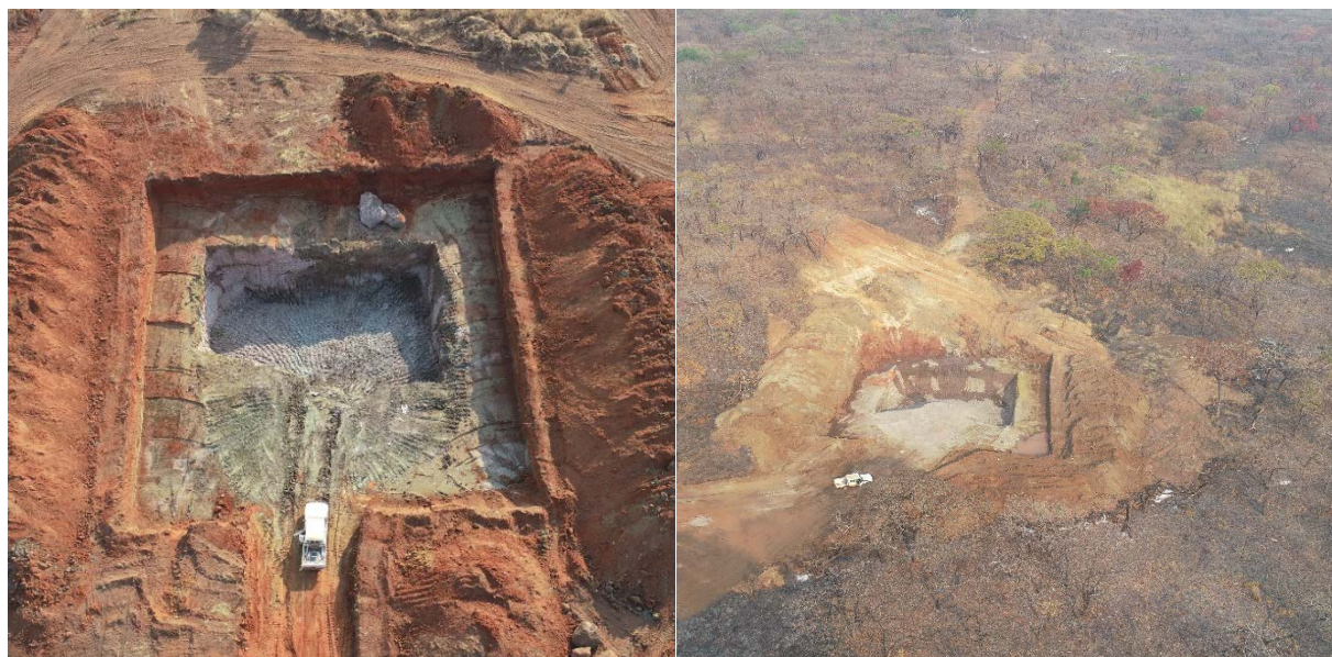
Bulk sampling sites at Lulo kimberlites L071 and L072