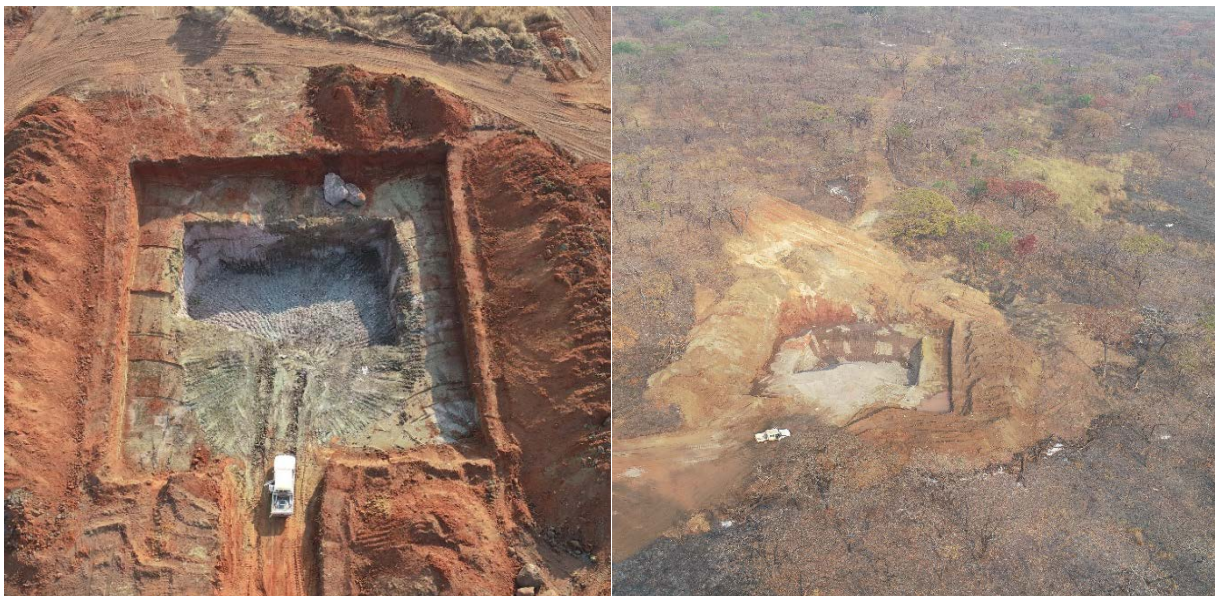
Bulk sampling sites at Lulo kimberlites L071 and L072