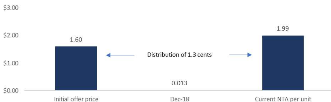
CD3 Unit Value and Income

The Fund's investment objectives are to provide Unitholders with exposure to a portfolio of investments in small-to-mid-market private investment funds and privately held companies, predominantly focused in the United States (US), and capital growth over a five to ten-year investment horizon.