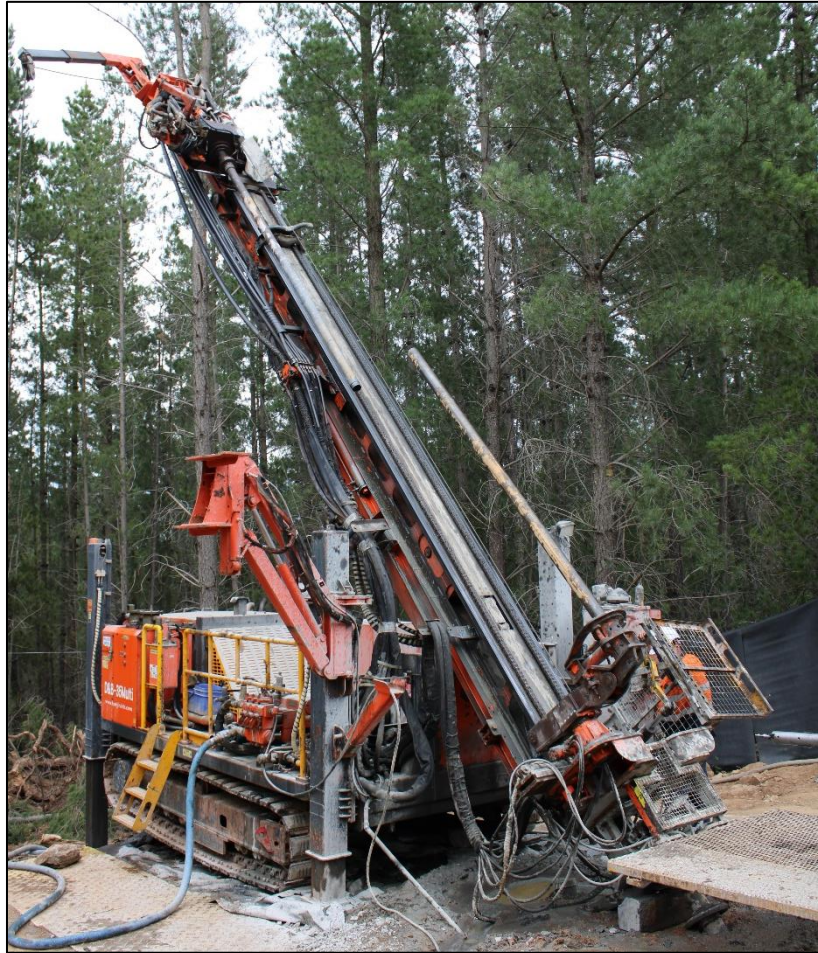
Figure 2: Diamond drill rig in operation at the Lightning Prospect, Castlemaine Gold Project (EL006679)