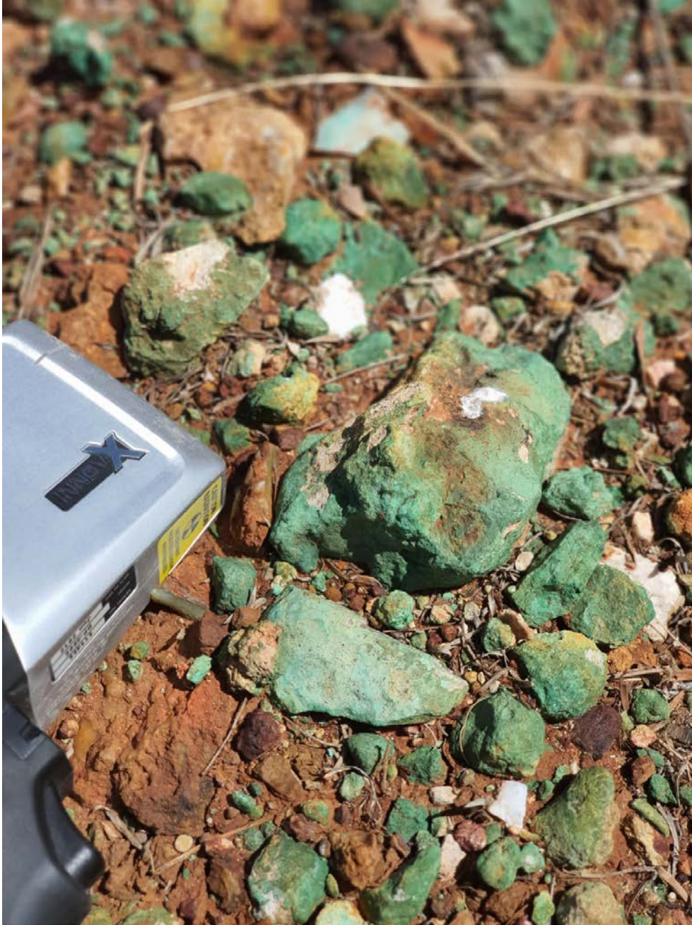
Figure 2 Crosswinds Copper Prospect - Malachite (copper carbonate) mineralisation exposed at surface

Given the recent Crosswinds copper discovery, and the lifting of interstate COVID-19 travel restrictions between WA and NT, an application for the formal grant of an initial five Exploration Licences in the immediate vicinity of the Tablelands Highway (EL32297, 32298, 32301, 32308 & 32309) was lodged with the NT Department of Industry, Tourism and Trade (DITT) late in December 2020. Written confirmation of the formal grant of these tenements was received within 24 hours of the request.