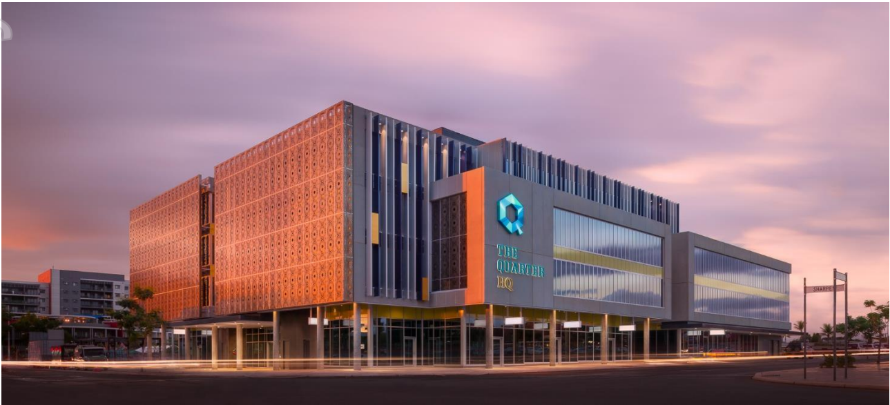
Figure 3: Location of BCI's Regional Office in Karratha

BCI has developed an Australian Industry Participation Plan for the Mardie Project, which was approved by the Department of Industry, Science, Energy and Resources in early January 2021. The plan provides a framework for BCI's engagement with Australian and local entities regarding contracting and procurement opportunities at the Project.