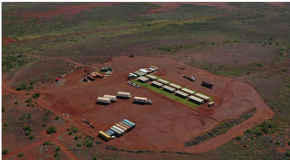
Figure 1: Accommodation Units Arriving at Mardie

Site activities underway at Mardie include establishment of the accommodation village, access roads, site communications, fuel storage, water bores and initial power supply facilities. Additional accommodation units have been delivered to the Mardie site for expansion of the existing 36-bed village to 80 beds. The accommodation village expansion will facilitate the remainder of the early works program and construction of the larger construction village.