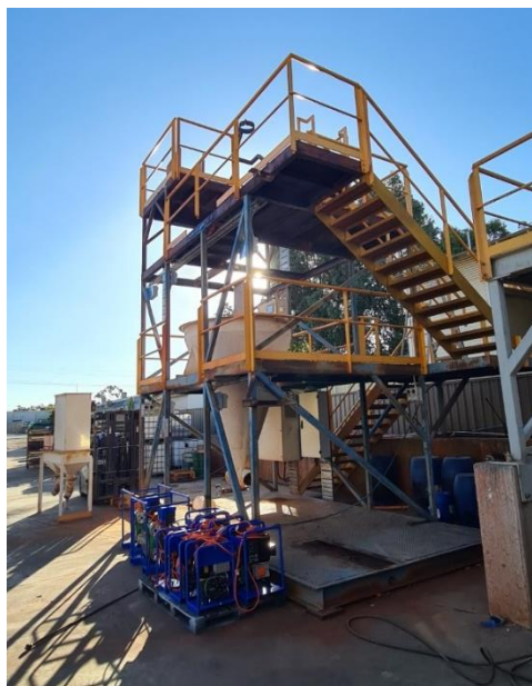
Figure 2: Salt Pilot Plant Under Construction

Nagrom has been engaged to construct and operate a salt pilot plant. The pilot plant is currently being assembled and a minimum of 20 tonnes of high purity salt is scheduled to be processed in Q1 2021. Outcomes from the program will assist with flowsheet finalisation and generate additional salt samples for testwork by potential offtake customers. The SOP pilot plant program is currently being scoped and is scheduled to occur in Q2 2021. Approximately 1 tonne of KTMS has been generated by the evaporation and crystallisation trials to date and additional KTMS will be available for the program.