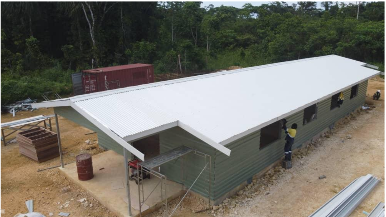
Figure 3: Community school dormitory under construction

A key milestone during the quarter was the finalisation and execution of a Relocation Amendment Agreement in relation to updated house designs. The Relocation Agreement and Relocation Amendment Agreement have now both been approved and registered by the MRA. Registration of these documents formalises community acceptance and allows the relocation program to move forward with Government support.