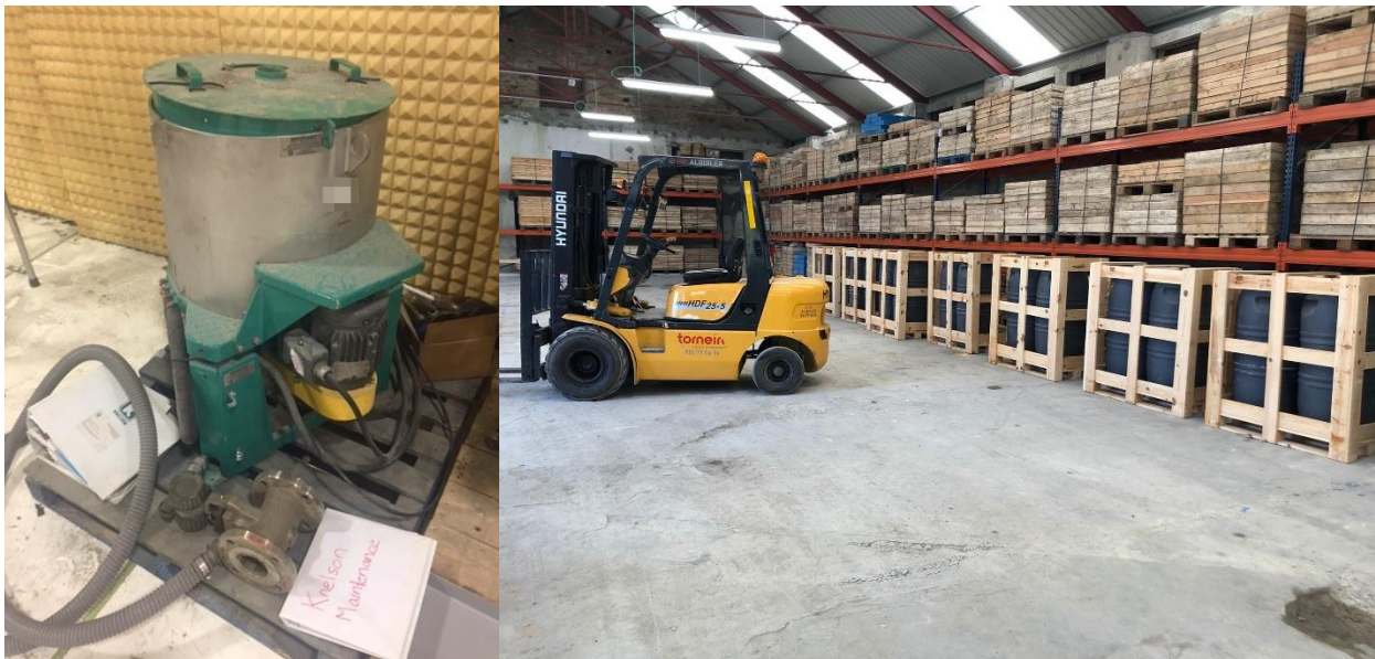
Figures 5 and 6: Knelson Concentrator CVD6-AP-G5 and bulk sample boxed and ready for shipment

An 8t bulk sample for final metallurgical test work has been collected and is due for shipment to Grinding Solutions in the UK next week. The Company has also acquired a second hand Knelson KC-CVD6 concentrator with ICS automated controls that will be utilised in the forthcoming test-work.