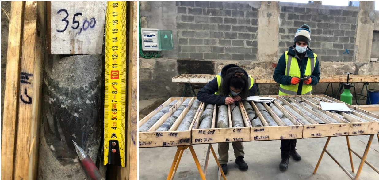
Figures 3 and 4: wolframite vein (4cm) and core from drill hole MC108