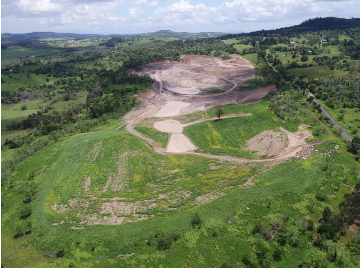
Normanton Pit Rehabilitation Works - New Oakleigh Site (as at 28 January 2021)

APC completed Phase 1 of the cattle grazing trials on the Oakleigh West rehabilitated land. A total of 110 heifers were weighed after 179 days of grazing, yielding an average daily gain of 0.62kg / day.