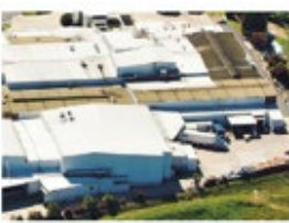
BEGA HEAD OFFICE AND PROCESSING & PACKAGING PLANT 23-45 Ridge Street Bega NSW 2550 Australia