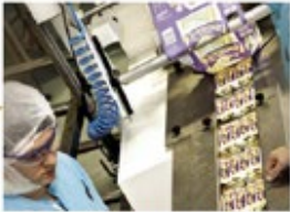
BEGA CHEESE MANUFACTURE 11-13 Lagoon Street Bega NSW 2550 Australia