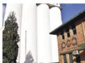
KINGAROY 133 Haly Street Kingaroy QLD 4610 Australia