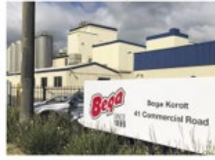
KOROIT 41 Commercial Road Koroit VIC 3282 Australia