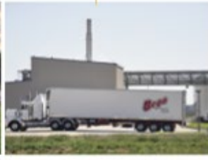
STRATHMERTON Murray Valley Highway Strathmerton VIC 3641 Australia