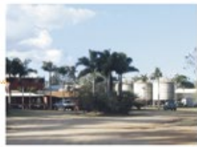
TOLGA 12 Tostevin Street Tolga QLD 4882 Australia