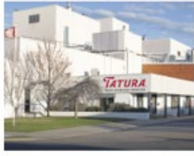
TATURA 236 Hogan Street Tatura VIC 3616 Australia