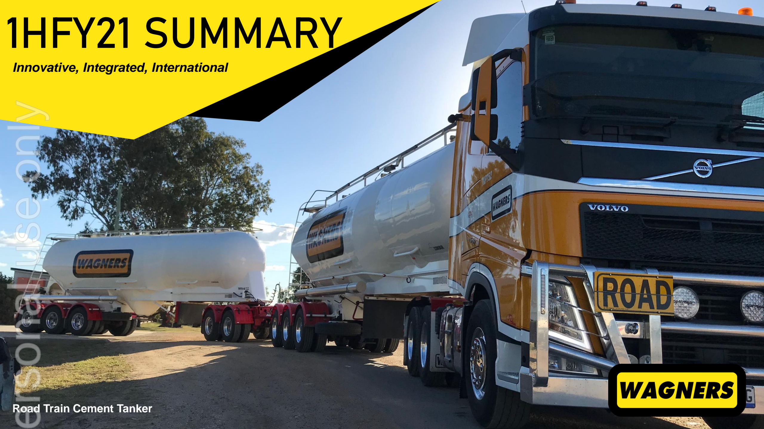
Road Train Cement Tanker