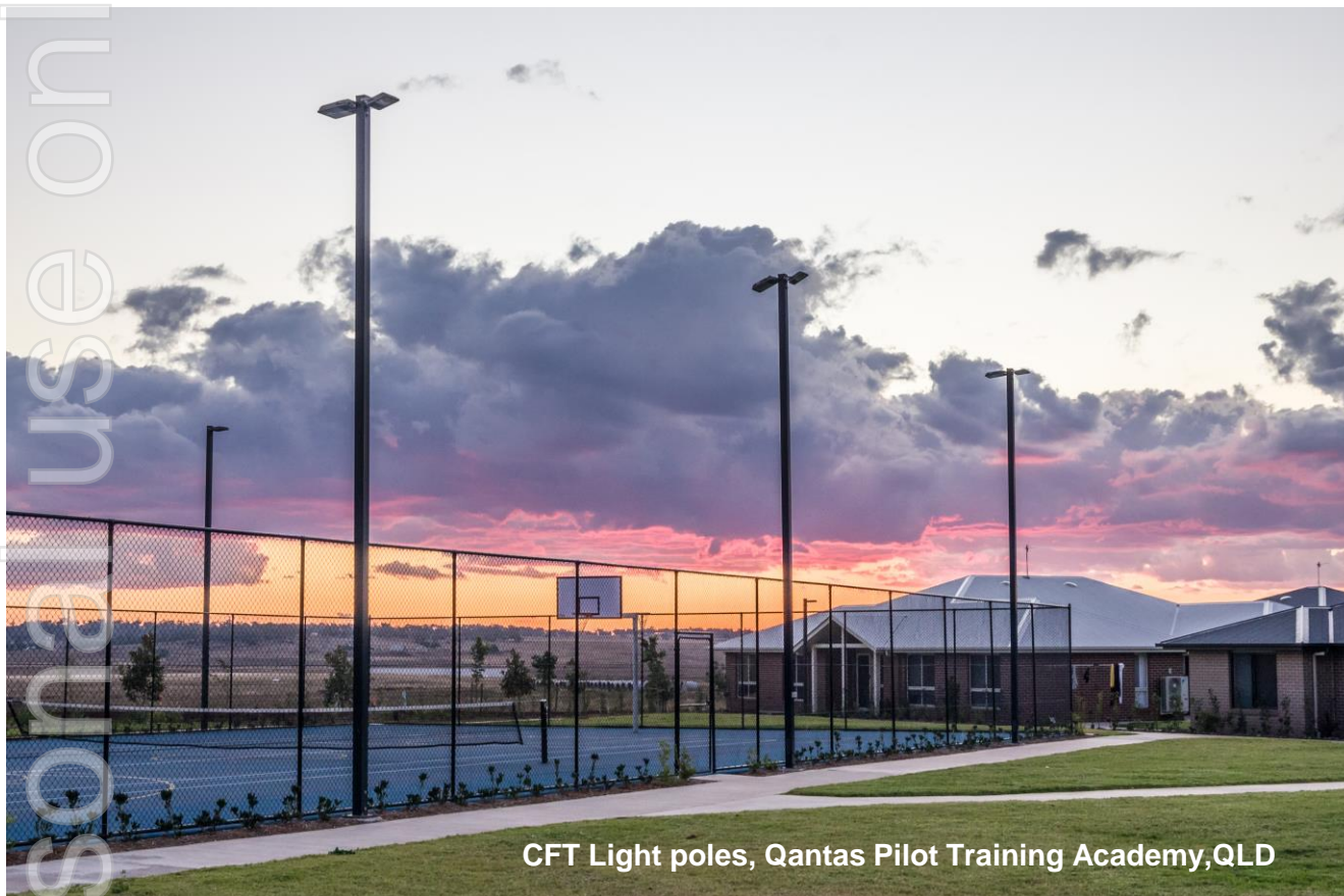
CFT Light poles, Qantas Pilot Training Academy, QLD