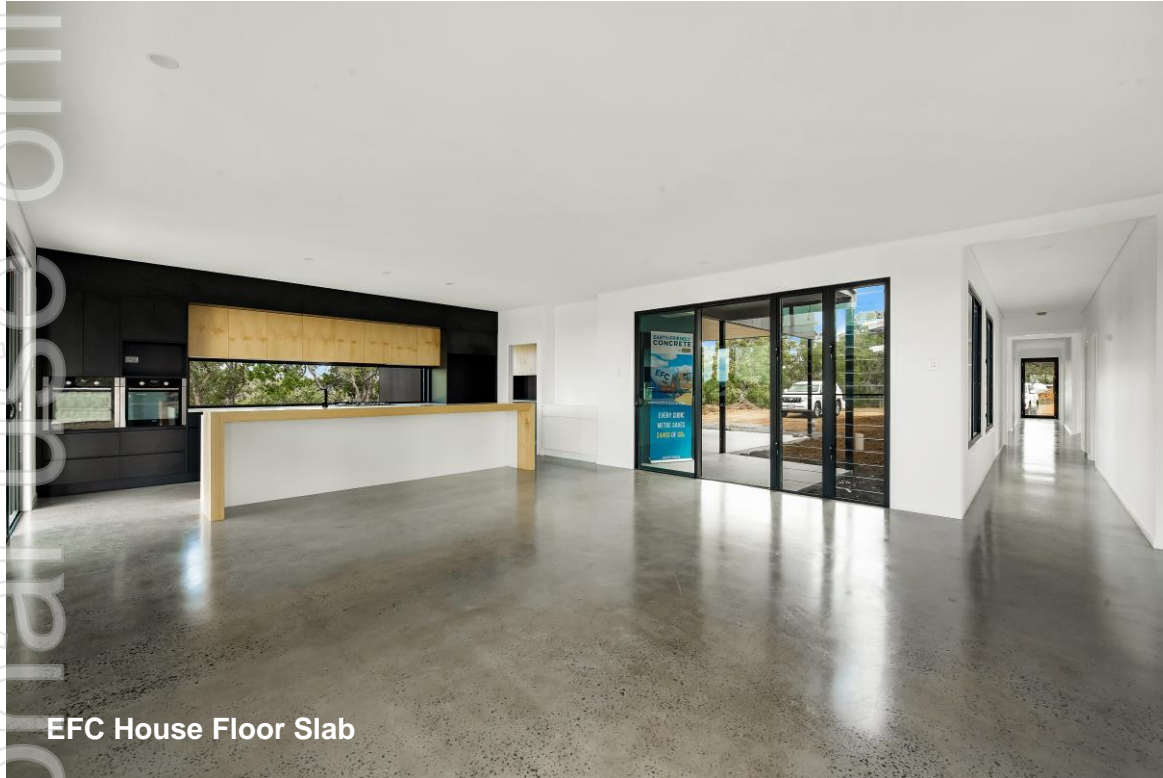
EFC House Floor Slab