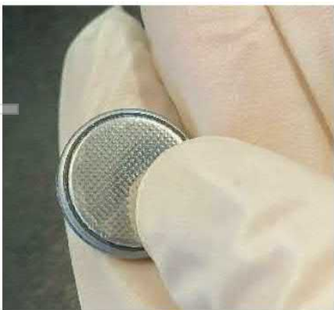
Figure 1: Novonix – Freshly assembled lithium-ion battery coin half-cell with Lake's lithium product