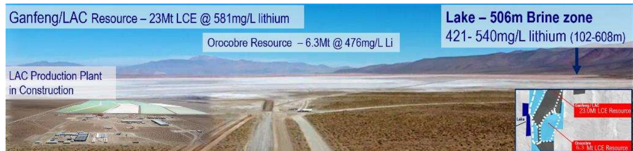
Figure 1. Location of Lake's Cauchari results in relation to the Lithium America's production development.