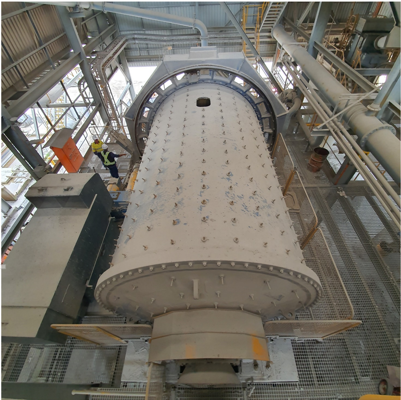
Figure 2: 1.85MW Outokumpu ball mill

In addition, the equipment has been acquired on the basis that it is the responsibility of Black Cat to remove it from site before 30 September 2021.