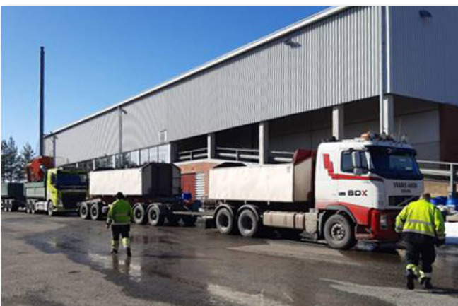
Figure 1. Vittangi graphite ore transported (L) to toll concentrator (R).