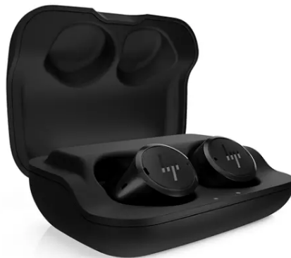
Figure 1: HP – “Easily collaborate and flow throughout the day with the HP Elite Wireless Earbuds, which connect to multiple devices and feature personalised audio tunings and noise cancellation”.

In early January 2021, HP Inc. launched HP Elite Wireless Earbuds as the world's most advanced earbuds for collaboration at the Consumer Electronics Show (CES) 2021. This is the first HP branded product to be manufactured by Nuheara under the recently announced three-year umbrella supply agreement with HP. The earbuds will be offered to HP customers as bundled options with selected HP notebooks.