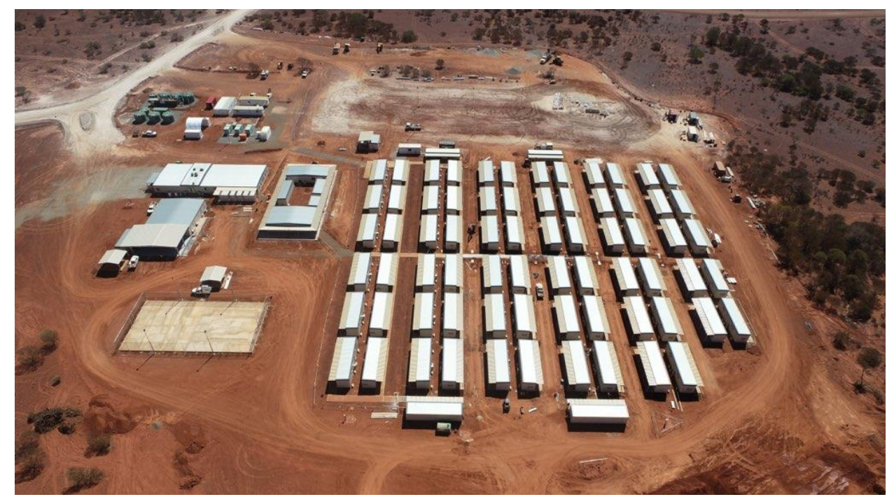
Figure 1. Aerial view of nearly completed Abra village.