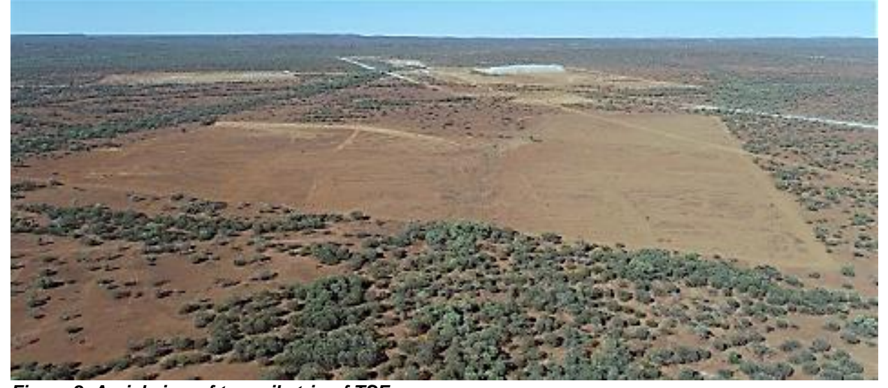
Figure 2. Aerial view of topsoil strip of TSF.