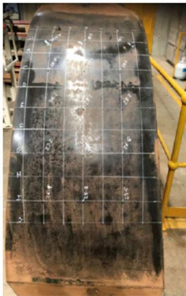
Fig.2c): ArmourGRAPH™ Liner After 62 weeks.