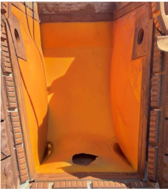
Fig.1: b) Standard PU Liner