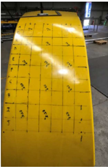
Fig.2a): Control PU Liner