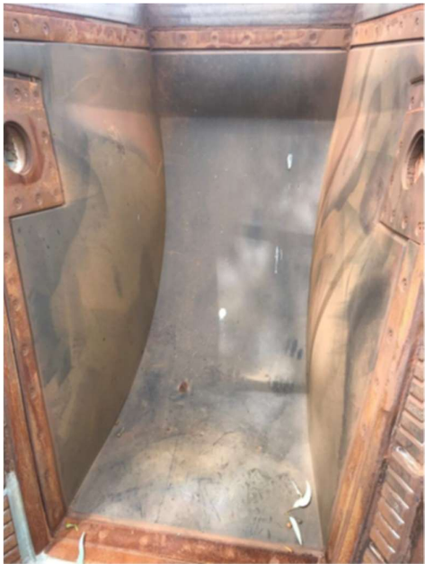
Fig.1: a) ArmourGRAPH™ Liner containing PureGRAPH® 20