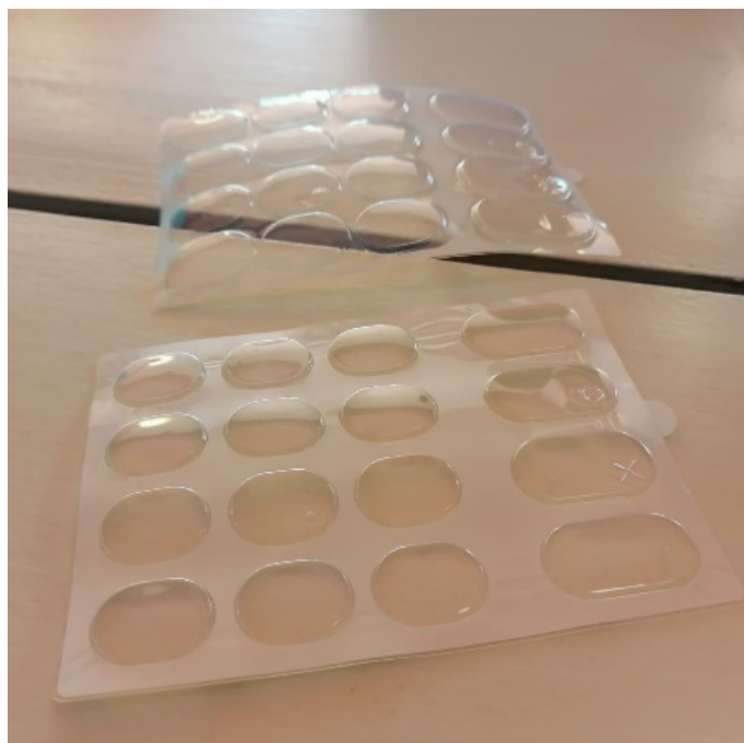
Figure 3: Nanoshield thermoformed plastic products

In order to create the product, Nanoveu exposes its Nanoshield antiviral material to heat and allows the product to set on a mould. The moulded product retains its antiviral protection with no loss in efficacy.