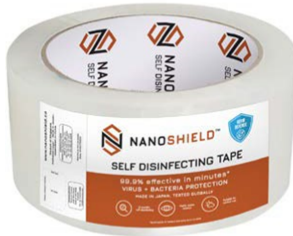
Figure 2: Nanoshield Tape

The Nanoshield tape is available in three roll length options: 10m, 20m and 50m and will be 10cm in width – similar to dimensions of standard packing tape (see Figure 2).