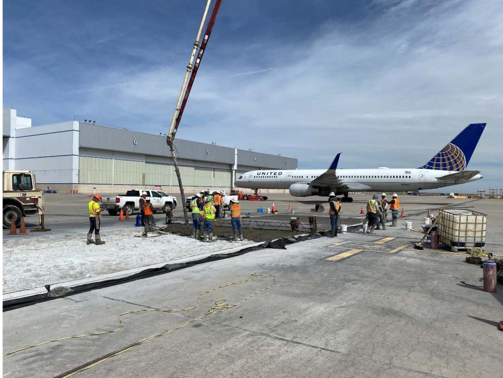
Figure 1 Replacement of first concrete panel on United Airlines maintenance hangar apron.

Both the General Contractor and the Contractor have shared that they are very happy with the performance of EdenCrete® to date and the benefits it provides. There are several more of these panels that will be replaced this year and in the future. Currently the General Contractor has said that there is a high probability, that EdenCrete® will be specified in the remaining placements at Denver International Airport, however the timing and total yardage is unknown at this time. With this pending success, there are additional opportunities that could be available with other airlines and Denver International Airport itself, as well as other airports.