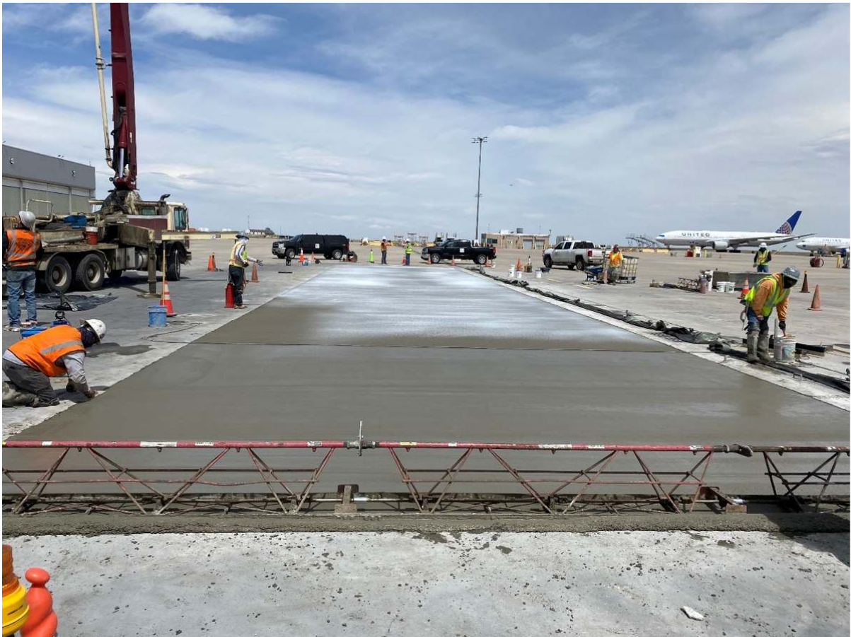
Figure 4 Finishing the 5-panel concrete replacement on United Airlines maintenance hangar apron