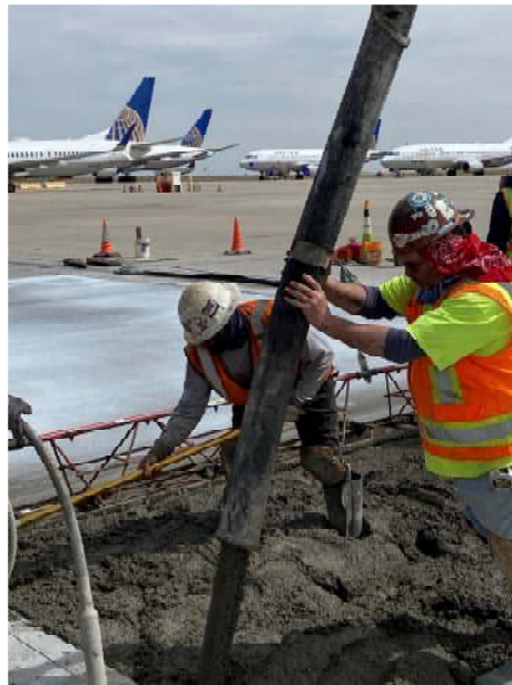
Figure 2 Pouring the replacement concrete panel on United Airlines maintenance hangar apron