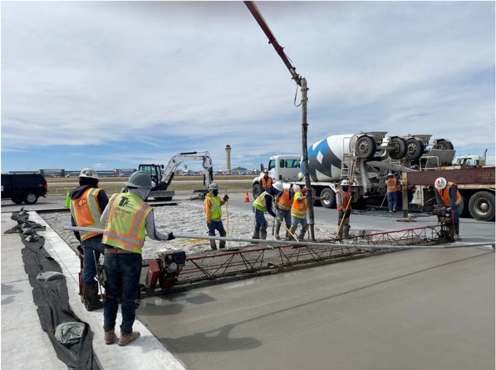
Figure 3 Pouring the replacement concrete panel on United Airlines maintenance hangar apron