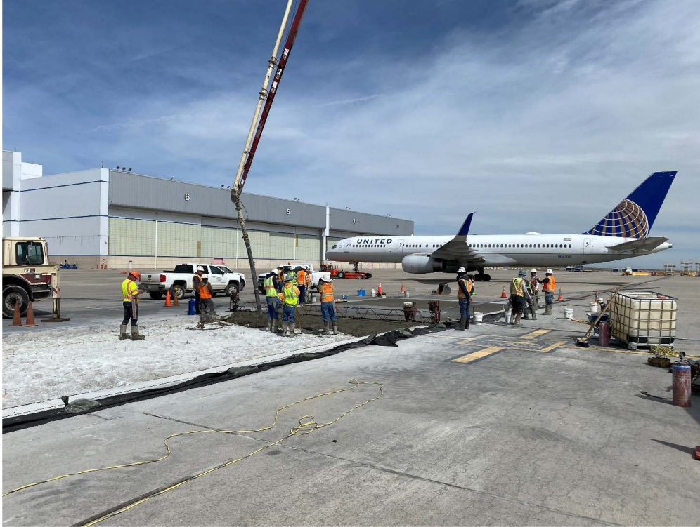
Figure 1 Replacement of first concrete panel on United Airlines maintenance hangar apron.

Both the General Contractor and the Contractor have shared that they are very happy with the performance of EdenCrete® to date and the benefits it provides. There are several more of these panels that will be replaced this year and in the future. Currently the General Contractor has said that there is a high probability, that EdenCrete® will be specified in the remaining placements at Denver International Airport, however the timing and total yardage is unknown at this time. With this pending success, there are additional opportunities that could be available with other airlines and Denver International Airport itself, as well as other airports.