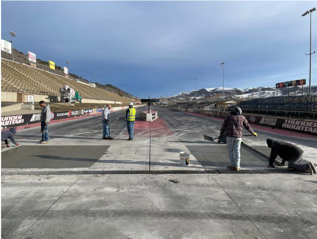
Figure 1. EdenCrete® concrete being placed in Burn Out Boxes