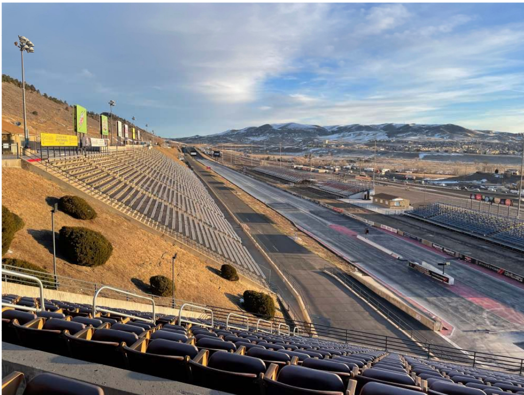
Figure 2. The Bandimere Speedway near Denver, Colorado, USA