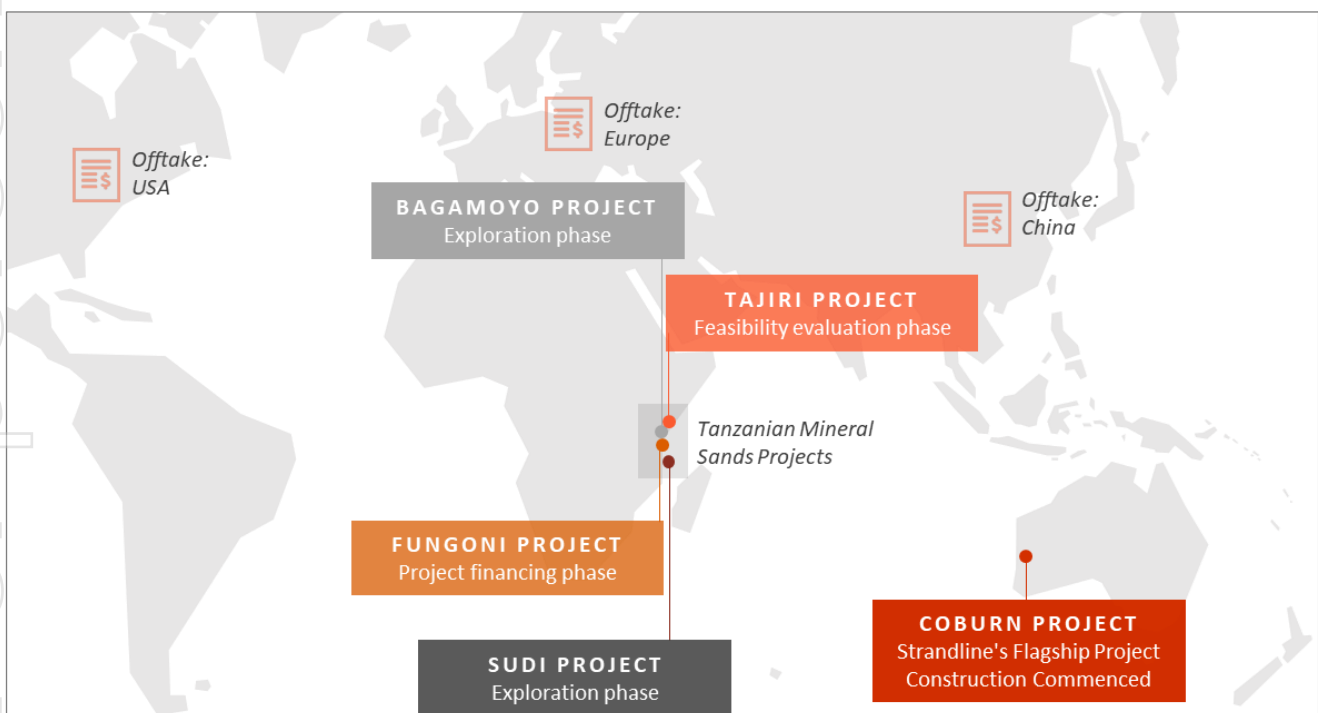
Figure 2 Strandline's global mineral sands exploration and development projects

This report contains certain forward looking statements. Forward looking statements are only predictions and are subject to risks, uncertainties and assumptions which are outside of the control of Strandline. These risks, uncertainties and assumptions include commodity prices, currency fluctuations, economic and financial market conditions, environmental risks and legislative, fiscal or regulatory developments, political risks, project delay, approvals and cost estimates. Actual values, results or events may be materially different to those contained in this announcement. Given these uncertainties, readers are cautioned not to place reliance on forward looking statements. Any forward looking statements in this announcement reflect the views of Strandline only at the date of this announcement. Subject to any continuing obligations under applicable laws and ASX Listing Rules, Strandline does not undertake any obligation to update or revise any information or any of the forward looking statements in this announcement to reflect changes in events, conditions or circumstances on which any forward looking statements is based.