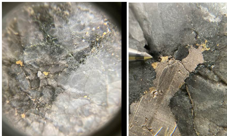
Photographs taken through a hand lens showing visible gold.