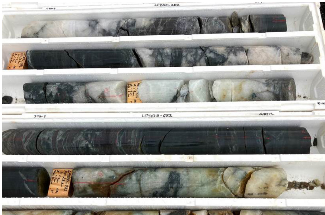
Hole LPDD21_082 from Lord Percy